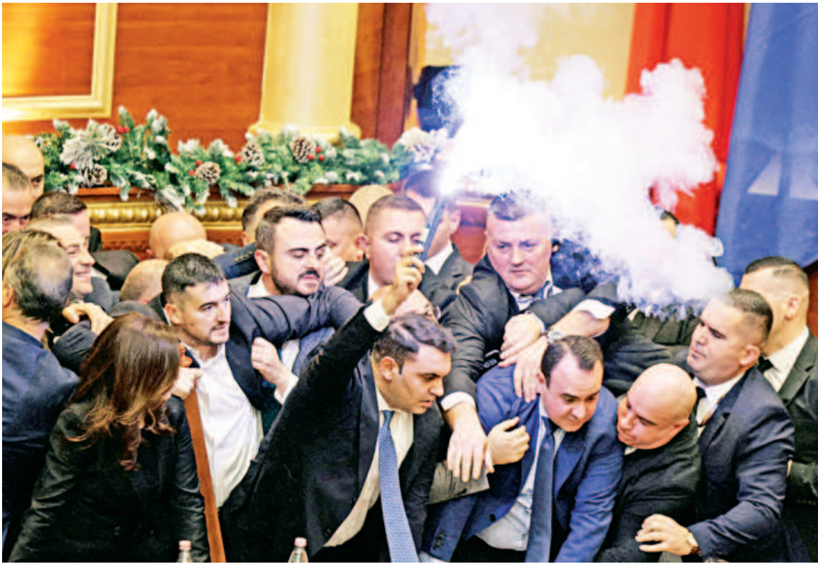
Members of parliament from the Democratic Party, Albania’s biggest opposition party, protest against the government inside parliament in Tirana, yesterday.

mine action activities,” it said. While some international aid groups have been registered under the system that was introduced in March, “the ongoing re-registration process and other arbitrary hindrances to humanitarian operations have left millions of dollars’ worth of essential supplies - including food, medical items, hygiene materials, and shelter assistance - stuck outside of Gaza and unable to reach people in need,” the statement read. The humanitarian situation has become desperate as winter storms pummel the territory. This has been compounded by Israel’s refusal to allow vital supplies, including mobile homes, into Gaza. The United Nations reported that roughly 30,000 children have been affected by storm damage to their shelters. Meanwhile, Qatar’s Prime Minister Sheikh Mohammed bin Abdulrahman bin Jassim Al Thani has warned that daily Israeli breaches of the Gaza ceasefire are threatening the entire agreement, as he called for urgent progress towards the next phase of the deal to end Israel’s genocidal war on the besieged Palestinian enclave, reports Al Jazeera online.