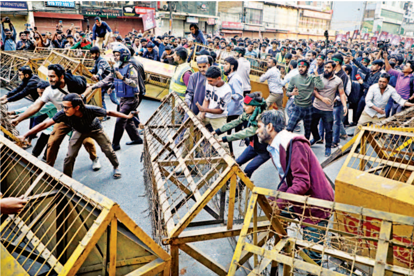
Protesters try to breach police barricades in the capital's Badda as they march towards the Indian High Commission yesterday afternoon. They eventually sat on the road and chanted slogans in favour of their demands, including the extradition of deposed prime minister Sheikh Hasina and others who fled there during and after last year's July uprising . Story on page 3.