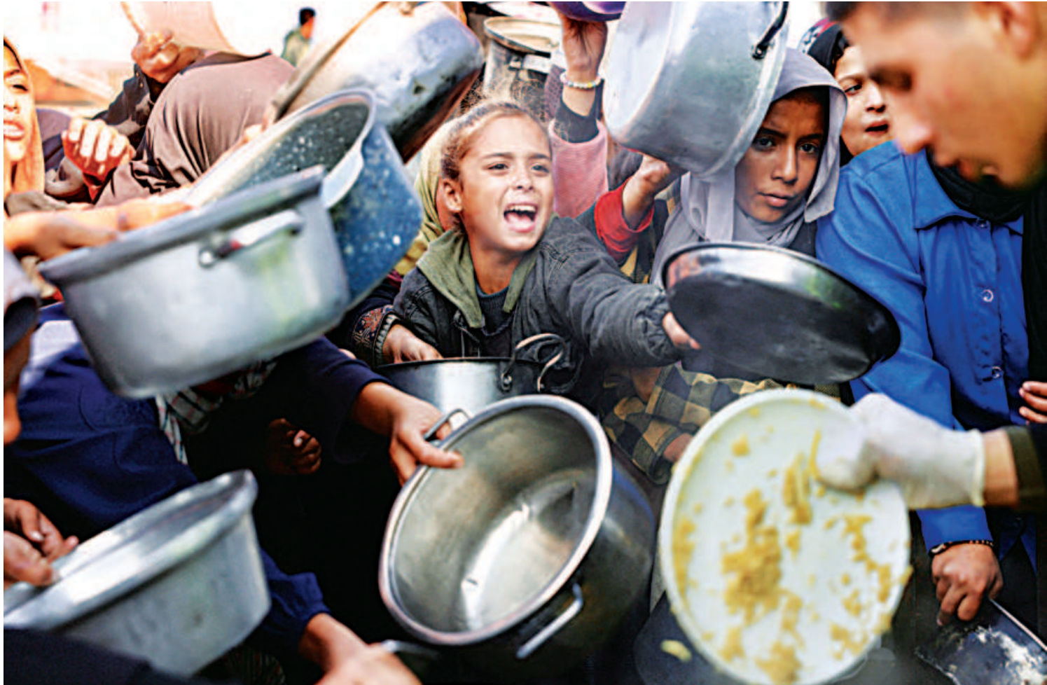
Displaced Palestinians gather to receive donated food portions at a charity kitchen in Khan Yunis, in the southern Gaza Strip, yesterday.

Among those arrested were a child and former prisoners, the advocacy group added. The raids took place in the governorates of Salbit, Jenin, Bethlehem, Ramallah, Nablus, Tulkarem, and Hebron.