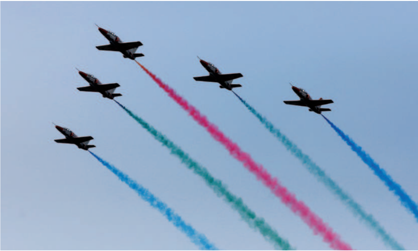
VICTORY IN THE SKIES... Marking the country's 54th Victory Day yesterday, the Bangladesh Air Force painted the skies with streams of colour, staging a spectacular display honouring the spirit of the 1971 Liberation War. The photo was taken from the capital's Bijoy Sarani area.