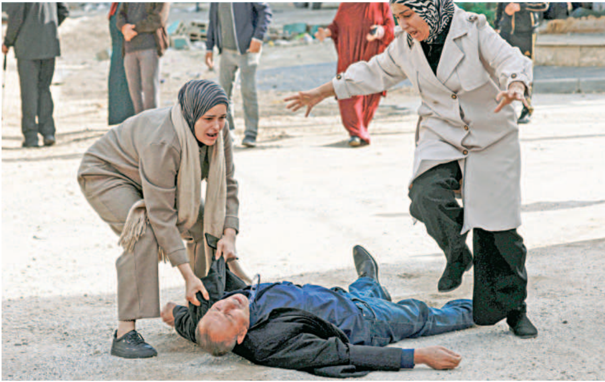
Palestinian women react as a man collapses at the entrance to the Nur Shams refugee camp in the Israeli-occupied northern West Bank yesterday, after residents were expelled earlier this year during an ongoing Israeli military operation.

REUTERS, Hong Kong Hong Kong's High Court yesterday found tycoon and pro-democracy campaigner Jimmy Lai guilty of conspiracy to collude with foreign forces in the city's highest-profile trial under a China-imposed national security law that could see him jailed for life. The landmark case has drawn international scrutiny of Hong Kong's judicial independence amid a years-long crackdown on rights and freedoms in the global financial hub after 2019 pro-democracy protests that Beijing saw as a challenge to its rule. While 78-year-old Lai's supporters see him as a freedom fighter, Beijing sees him as a mastermind of the protests and a conspirator advocating for US sanctions against Hong Kong and the mainland. Chinese authorities have rejected accusations of eroding the city's rule of law. "There is no doubt" that Lai "had harboured his resentment and hatred of" China for many of his adult years, Judge Esther Toh told a packed courtroom as the tycoon, wearing a pale green jumper and a grey jacket, sat with his arms folded.