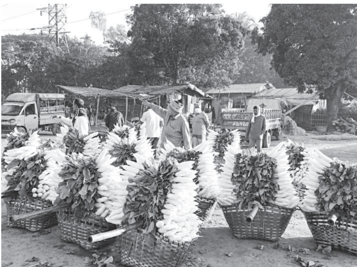
Radishes grown on riverine chars along the banks of the Sangu River in Chandanaish, Chattogram, being transported to Dohazari for sale to wholesalers. Winter vegetables -- including radishes, eggplants and beans -- are now in high demand at markets across the port city. The photo was taken yesterday.