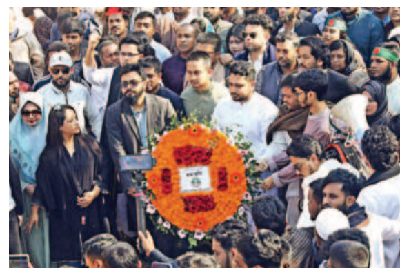
President Mohammed Shahabuddin, Chief Adviser Prof Muhammad Yunus, leaders and activists of the BNP and National Citizen Party, and people from all walks of life pay tribute to the martyred intellectuals of 1971 by placing wreaths at the Martyred Intellectuals Memorial in the capital's Mirpur, marking the Martyred Intellectuals Day yesterday.