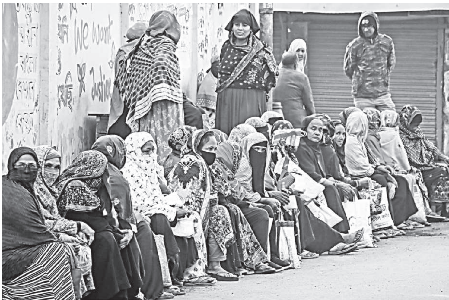
Women brave the winter chill, collect tokens, and wait in long queues to buy rice and flour at fair prices. With the cost of essentials rising, low-income families depend on OMS (open market sale) dealers for subsidised staples. The photo was taken on Sher-e-Bangla Road in Khulna recently.

Police recovered the body around 11:30am and said it would be sent for autopsy.