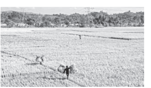
From above, the vast arable stretches of Gumai Beel in Rangunia, Chattogram -- one of the country's largest paddy storehouses -- resemble a giant nakshi kantha. Inset, farmers lay out freshly harvested paddy to dry for two to three days, a daily rhythm during the harvesting season across the beel's 2,400 hectares. The photos were taken yesterday.