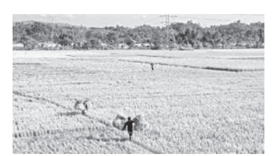
From above, the vast arable stretches of Gumai Beel in Rangunia, Chattogram -- one of the country's largest paddy storehouses -- resemble a giant nakshi kantha. Inset , farmers lay out freshly harvested paddy to dry for two to three days, a daily rhythm during the harvesting season across the beel's 2,400 hectares. The photos were taken yesterday.