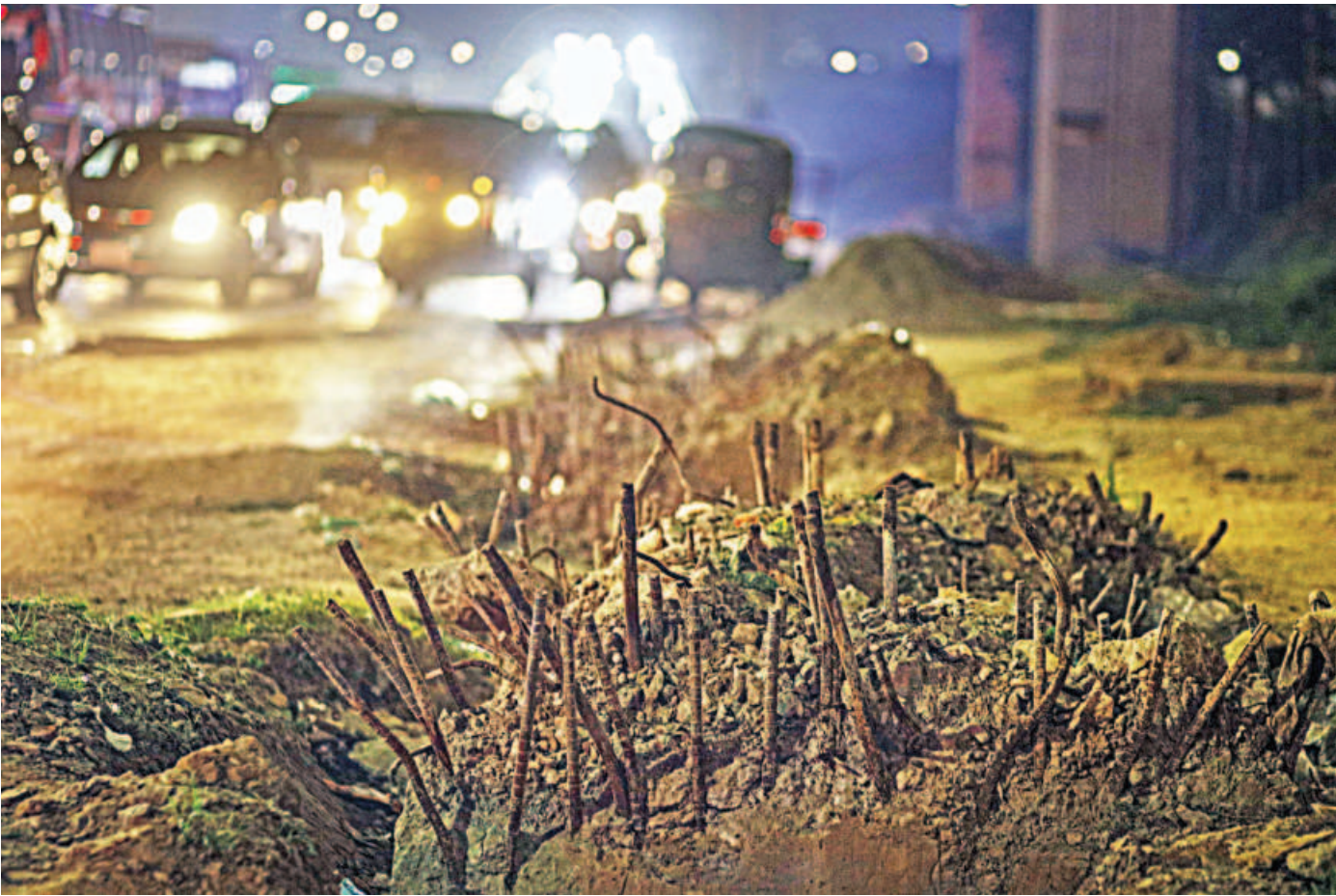
HAZARD ALERT... Eight months after this footbridge near Kuril was demolished for the Dhaka Elevated Expressway, exposed iron rods still poke out of the ground dangerously close to the airport road, making the area unsafe for pedestrians and vehicles alike.