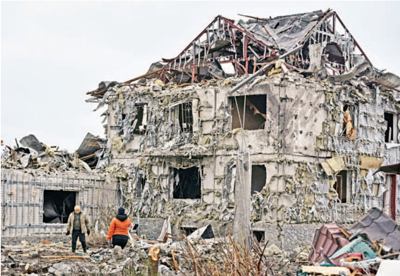
People stand near a building hit in a Russian missile and drone strike in the town of Slobozhanske in Ukraine's Dnipro region yesterday.