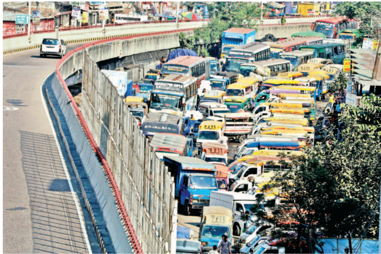
Long-route buses and trucks struggle to enter the capital beneath the Jatrabari-Gulistan flyover due to an illegal leguna stand, causing heavy traffic and delaying commuters. The photo was taken in the Jatrabari area yesterday.