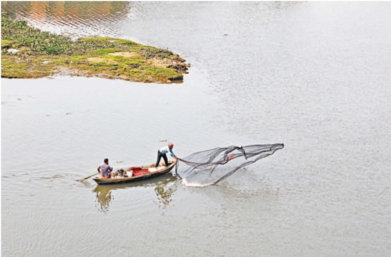
Fishermen cast their nets in the Turag River near Bosila. The relocation of tanneries from the Rayer Bazar area to Savar has led to a decline in pollution levels in the capital's rivers, making them once again habitable for fish. The photo was taken recently.