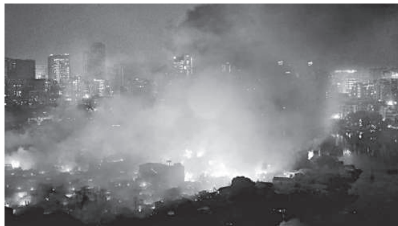
Slum fires are not accidents but a predictable by-product of inequality and policy failure.

People migrate to Dhaka mostly out of necessity. They come in