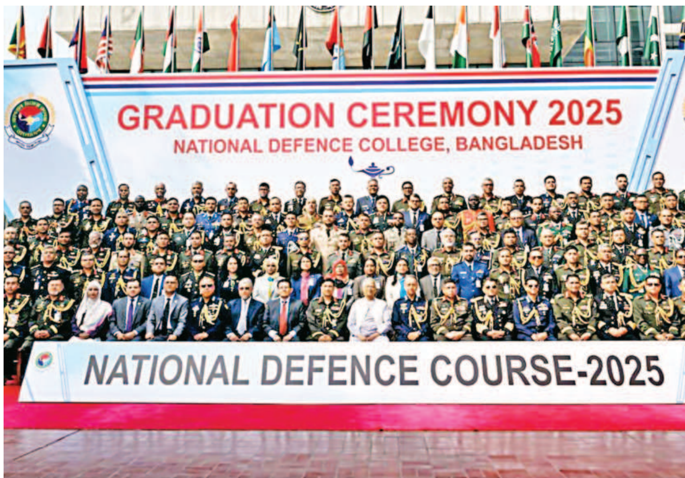
Chief Adviser Prof Muhammad Yunus at a photo session during the graduation ceremony of the National Defence Course and Armed Forces War Course 2025 at the National Defence College in Mirpur Cantonment in Dhaka yesterday.