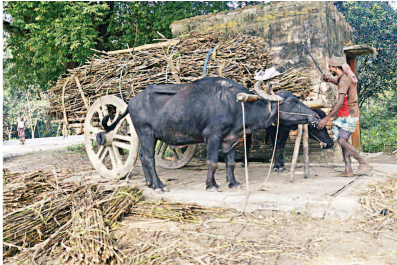
Sugarcane being unloaded from a buffalo cart at a centre in Charghat upazila, Rajshahi, for weighing before being sent to Rajshahi Sugar Mills Ltd. In Charghat and Bagha upazilas, farmers continue to use buffalo and bullock carts to transport their produce from fields to sugarcane centres as they are cost-effective.