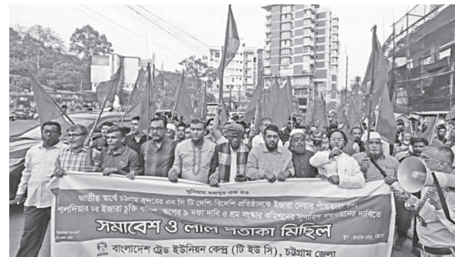
Bangladesh Trade Union Centre brings out a procession in Chattogram's Probartak area yesterday, protesting the government's decision to lease out port terminals to foreign operators.