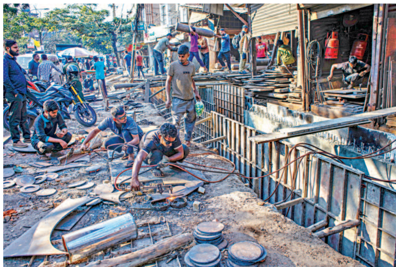
Labourers work with metal items without any safety gear, occupying a large section of the road in the capital's Dholaikhal area and putting themselves and pedestrians at risk. The situation is made worse by ongoing road development work, which further narrows the space for safe movement. The photo was taken yesterday.