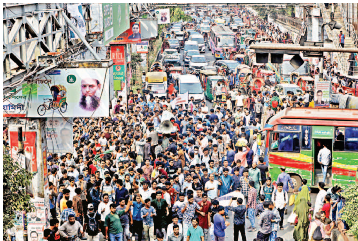
Students block the Science Lab intersection yesterday, demanding the immediate issuance of an ordinance for Dhaka Central University, which comprises seven government colleges in the capital. The blockade disrupted vehicular movement and caused traffic jams in the area.

The government had said the app only helps track and block stolen phones and prevents them from being misused.