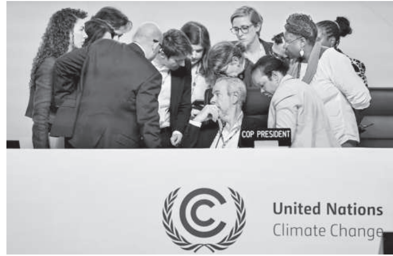
Delegates engage in tense negotiations at the COP30 in Belém, Brazil, which failed to deliver concrete actions in phasing out fossil fuels and advancing climate finance.

Although COP30 revealed serious gaps between scientific urgency and political action, leaving vulnerable countries exposed to rising seas, deadly heat, water shortages and destructive floods, it should not be dismissed as a failure. The new finance programme, adaptation indicators, just transition mechanism and attention to trade and gender offer frameworks that countries can build upon. However, this global progress will only matter for Bangladesh and other climate-vulnerable countries if national governments act decisively through strengthening adaptation plans, expanding green industries, protecting ecosystems and preparing workers for a low-carbon future.