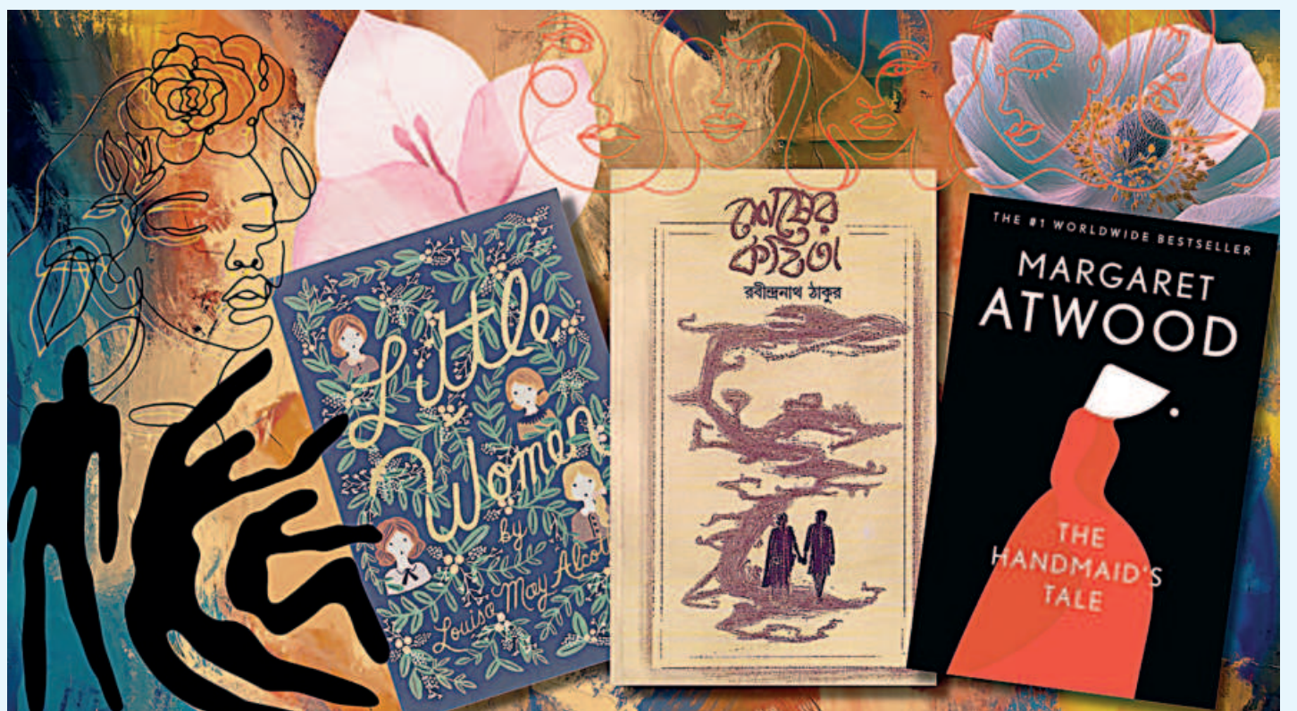
ILLUSTRATION: MAISHA SYEDA

And in Ashapura Devi's Prothom Pratisruti (1964), Satyabati grows up in a society where aspirations for women are circumscribed by deeply entrenched patriarchal norms. From a young age, she