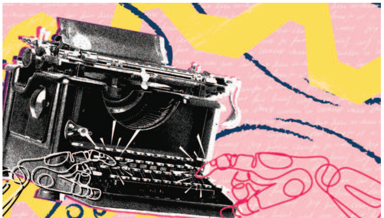
ILLUSTRATION: ABIR HOSSAIN

“These sessions jumpstart creativity and promote originality,” Digonto adds. “Then, students move into drafting part of the writing in person without using any