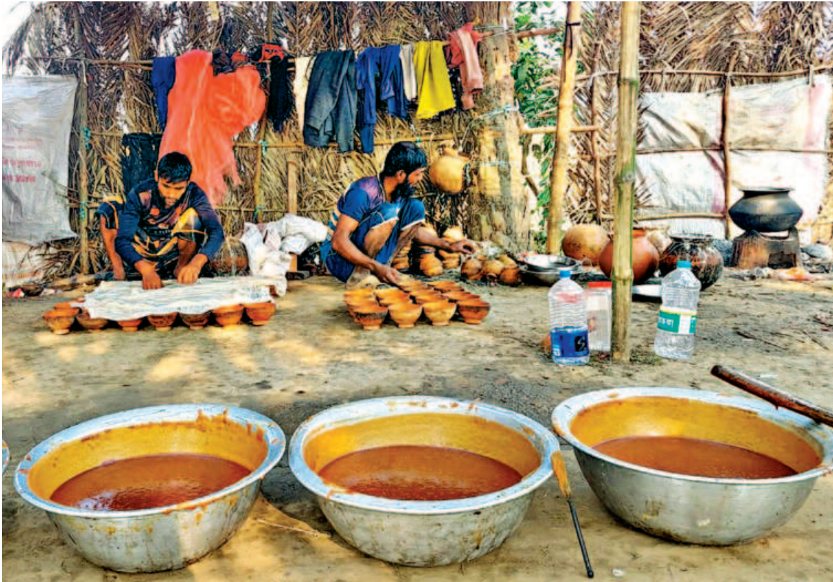
Date palm sap collectors, known as “gachhis”, process freshly collected date juice into molasses in earthen pots near Kushtia’s bypass road yesterday. With winter setting in, production of the seasonal delicacy has begun in the district, as demand surges across the country at this time.