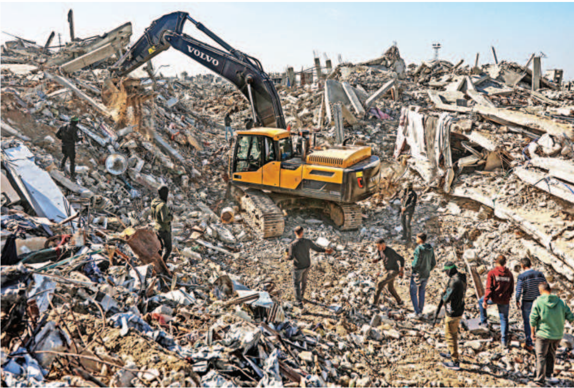
Hamas members and Egyptian workers, joined by Red Cross members, use a digger to search for the final two bodies of hostages in Jabalia refugee camp in northern Gaza Strip yesterday.