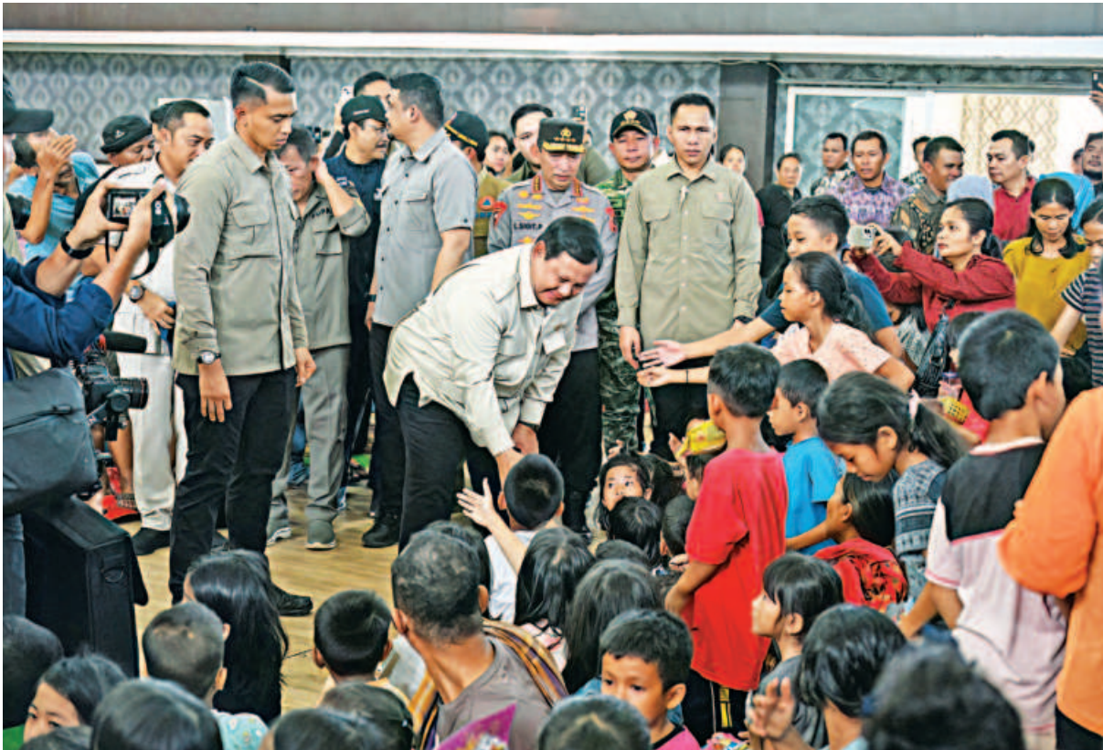
Indonesia’s President Prabowo Subianto meets child survivors of a flash flood at an evacuation post in Pandan, North Sumatra, yesterday.