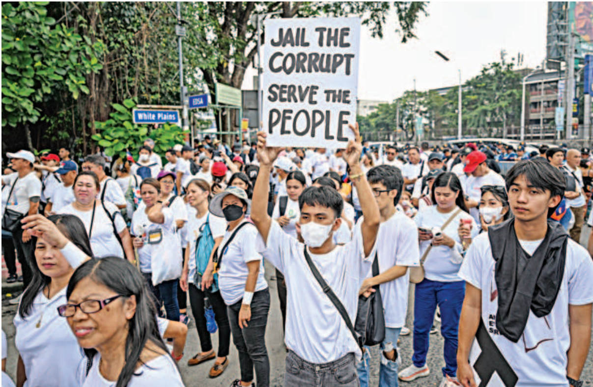
Protesters take part in an anti-corruption rally along Epifanio de los Santos Avenue (EDSA) in Quezon City, Metro Manila, yesterday. Thousands gathered in the Philippine capital demanding accountability over a multi-billion-dollar infrastructure scandal that has implicated officials, lawmakers, and construction firm owners.