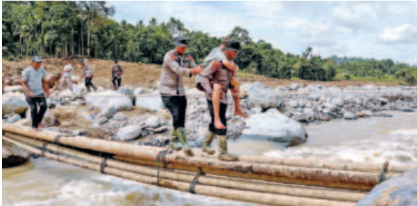
People with their belongings wade through a flooded street after heavy rainfall in Wellampitiya on the outskirts of Colombo yesterday. Sri Lankan authorities battled rising floodwaters in parts of the capital after the powerful Cyclone Ditwah left a trail of destruction, killing at least 334 people across the country.

REUTERS, Jakarta The death toll mounted to over 600 from floods and landslides caused by torrential rains across three countries in Southeast Asia, officials said yesterday, as relief efforts for tens of thousands of displaced people continued over the weekend. Indonesia, Malaysia and Thailand faced large-scale devastation after a rare tropical storm formed in the Malacca Strait fuelling heavy rains and wind gusts for a week. There were 435 dead in Indonesia, 170 in Thailand, and three deaths reported in Malaysia. Rescue and relief officials in the Southeast Asian countries were still trying to get access to many flood-hit areas yesterday even as flood waters receded and tens of thousands of people were evacuated across the three