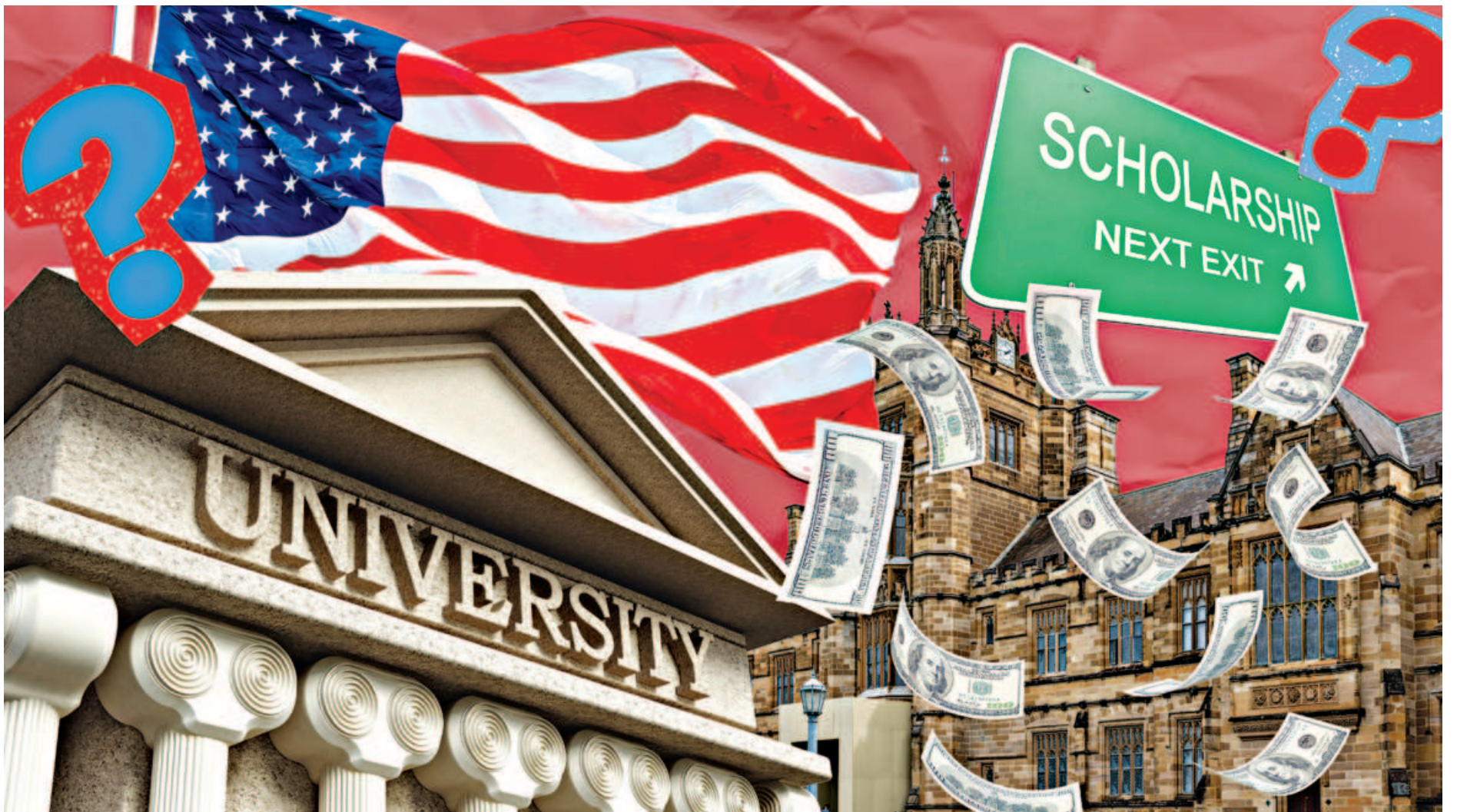
ILLUSTRATION: AZRA HUMAYRA