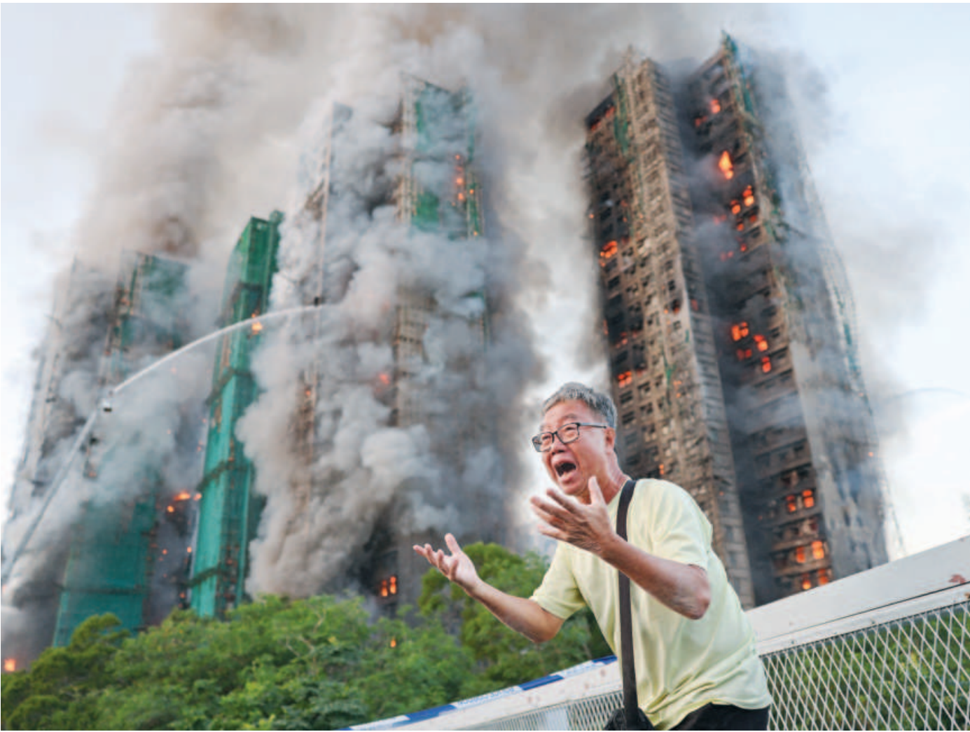
A man breaks down in tears in front of the burning high-rise residential towers in Tai Po, Hong Kong, China, yesterday. He said his wife was trapped inside one of the buildings.