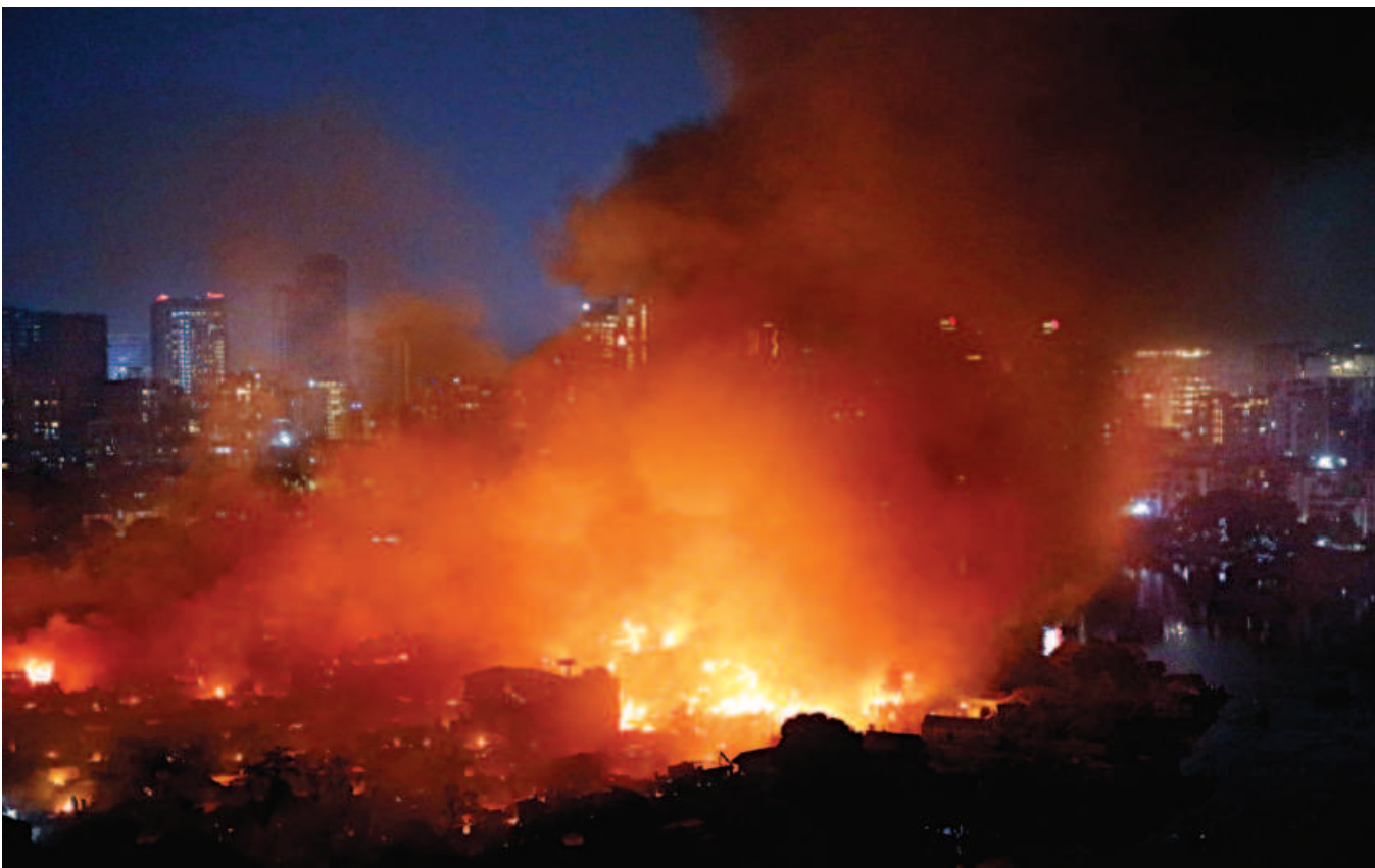
Plumes of smoke rise over the Korail slum after a massive fire broke out at the densely populated settlement in the capital's Mohakhali yesterday evening.