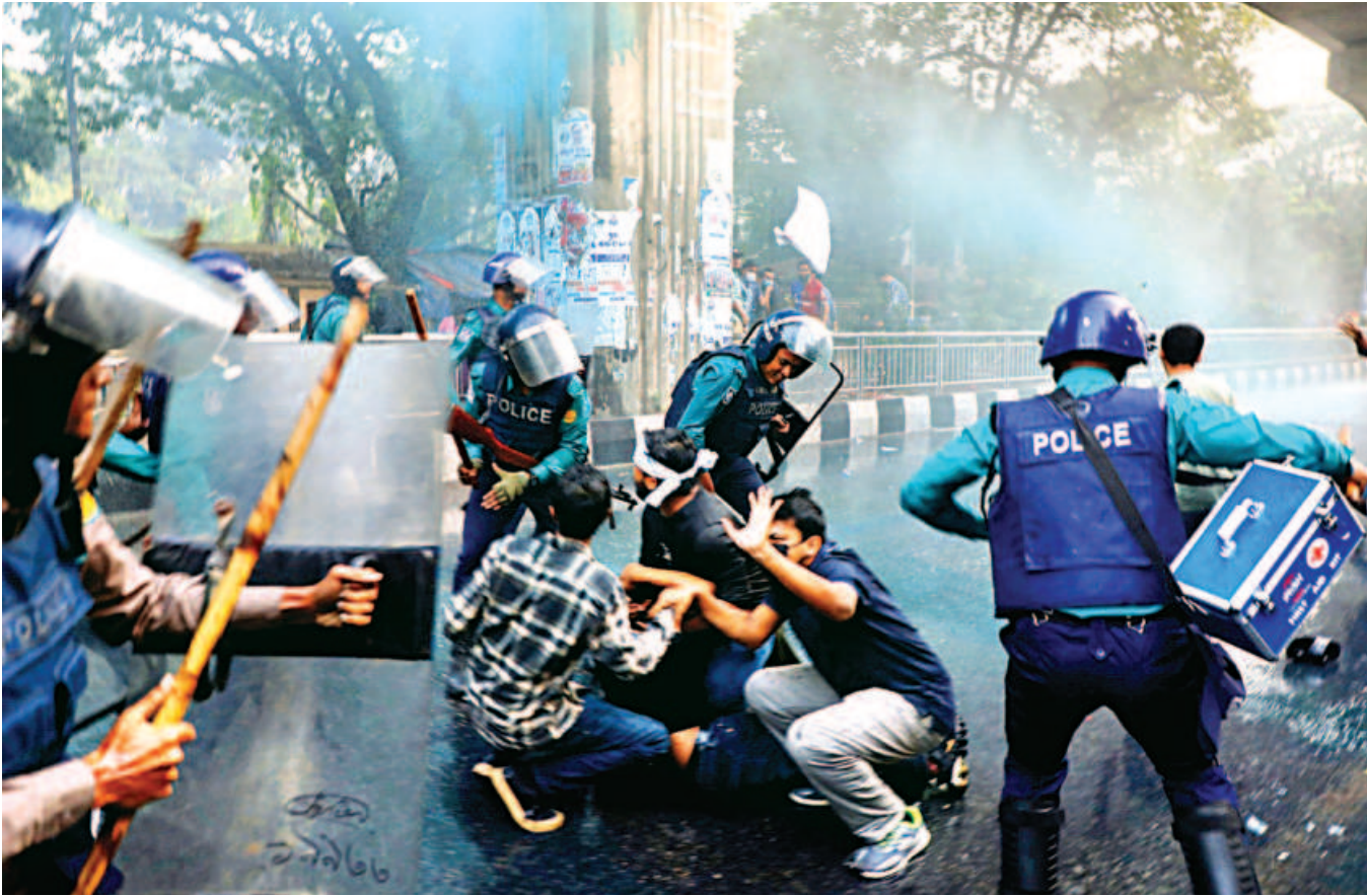
Police charge truncheons on candidates of the 47th BCS exams as they demonstrate to demand postponement of their written test. The photo was taken yesterday afternoon in the capital's Shahbagh.

The Anti-Corruption Commission is expected to hold a briefing on the matter soon. Another vault registered in Hasina's name was opened the same day at Pubali Bank, but officials said no assets were found there. The development comes amid ongoing scrutiny of financial records linked to political figures.