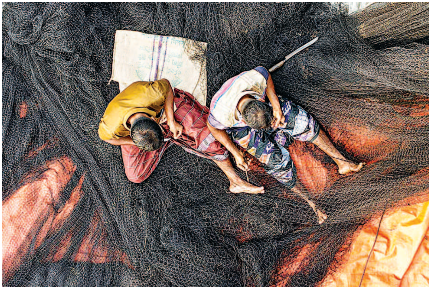
Fishermen mend their nets inside the Sundarbans. After obtaining permits from the Forest Department, they live in temporary shelters in Dublar Char for six months to catch fish and earn their livelihood. The photo was taken recently.