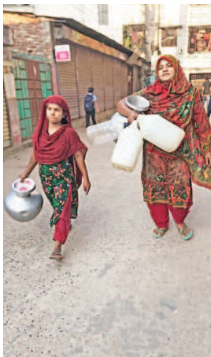
Crowds gather daily at mosques in Jurain to collect water for drinking, cooking, and washing as a Wasa pump failure has halted supply through its pipelines in several parts of the area for the past four days. The photos were taken recently.

"When the lines are empty for two or three days, it takes time for the pressure to build up. The connection work was completed on Tuesday night. Some improvement has already started – we are getting phone calls from people saying they're getting water, and we hope the problem will be completely resolved soon," he said.