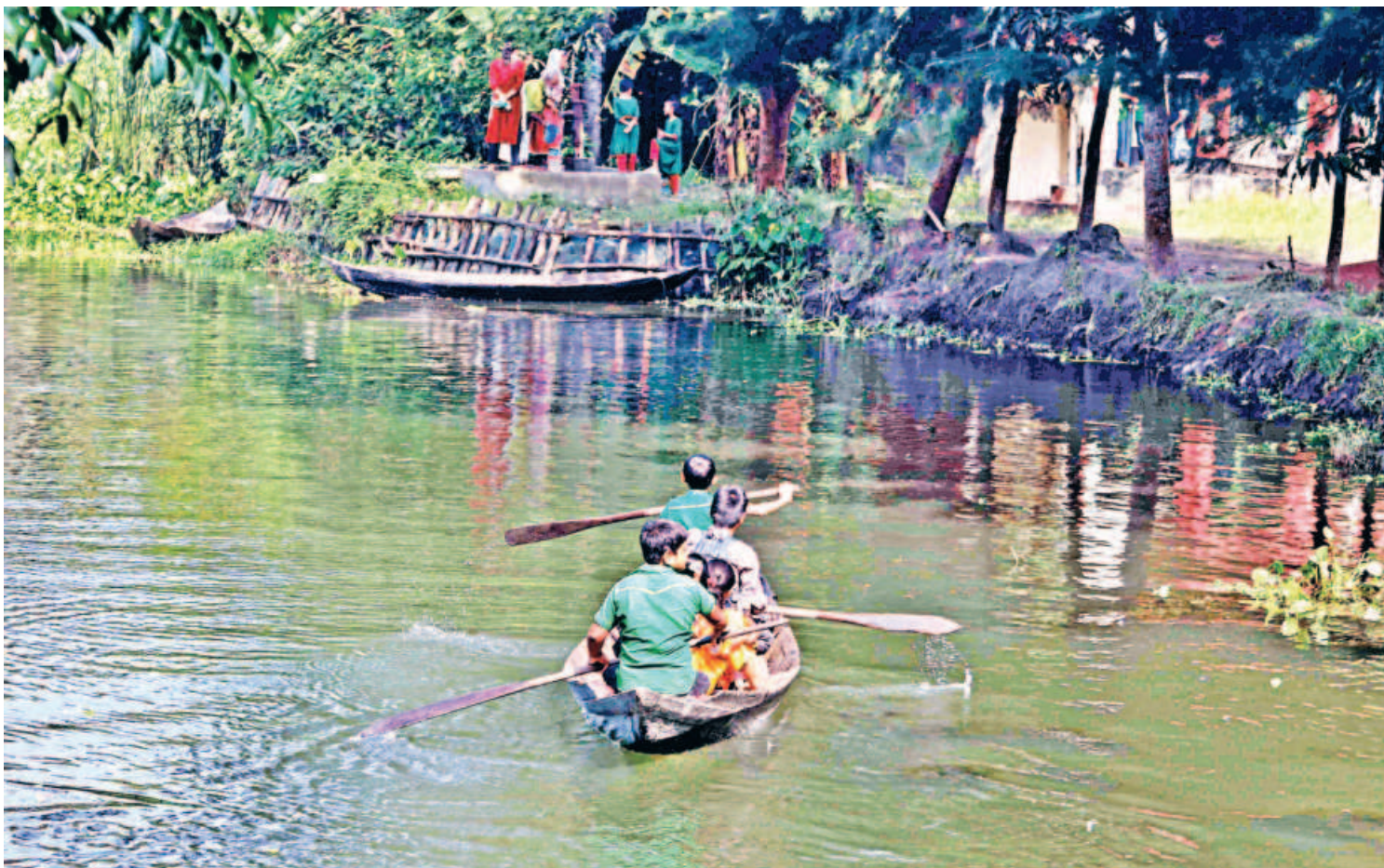
Children row a boat across the marshland in Manoharpur village of Pirojpur's Nazirpur upazila to reach their school. With no road access, they depend on boats year-round, risking their safety to continue their education. The photo was taken recently.

CPB, JSD, Bangladesher Samajtantrik Dal, Bangladesher Biplobi Workers Party, Bangladesh Nationalist Front, and Bangladesh Nationalist Movement will join the afternoon session.