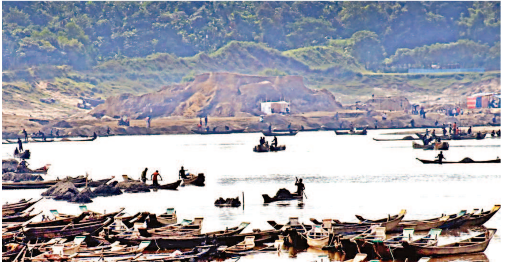
Despite a ban, sand extraction from the Piyain river in Sylhet's Jaflong area continues in plain sight. Locals allege that poor monitoring allows traders, aided by corrupt officials, to freely lift sand from the riverbed with small boats, putting the environment at risk. The violation is even more glaring in light of the recent uproar over a similar incident at the Sada Pathor area in Sylhet's Bholaganj. The photo was taken yesterday.