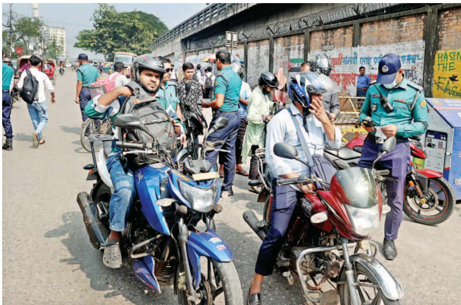
Police check documents and bags of motorcyclists at a temporary checkpoint near the U-loop on DIT Road in the Rampura TV Bhaban area. Law enforcers have stepped up security in the capital to prevent untoward incidents. Several crude bomb and arson attacks were reported in Dhaka yesterday.