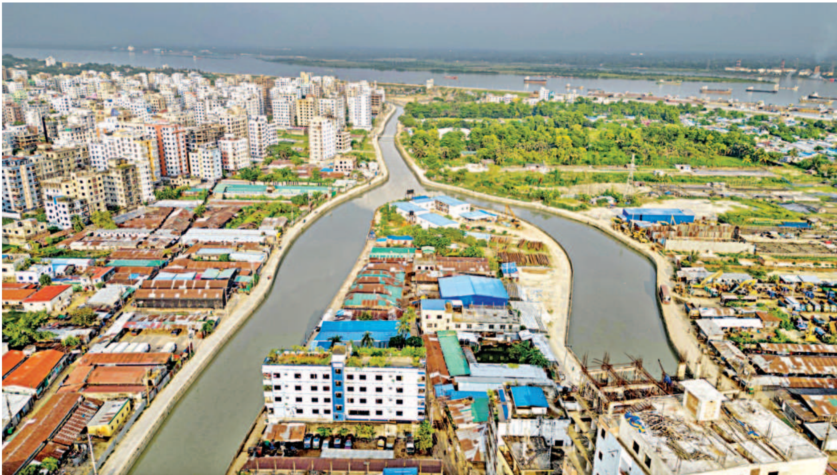
The Chattogram Development Authority is digging 36 canals across the port city to restore its waterways. With work on at least 20 canals completed, many appear healthy. The photo shows the Rajakhali canal in the Bakolia area.

Akhter called for immediate implementation of the reforms agreed upon during talks between political parties and the National Consensus