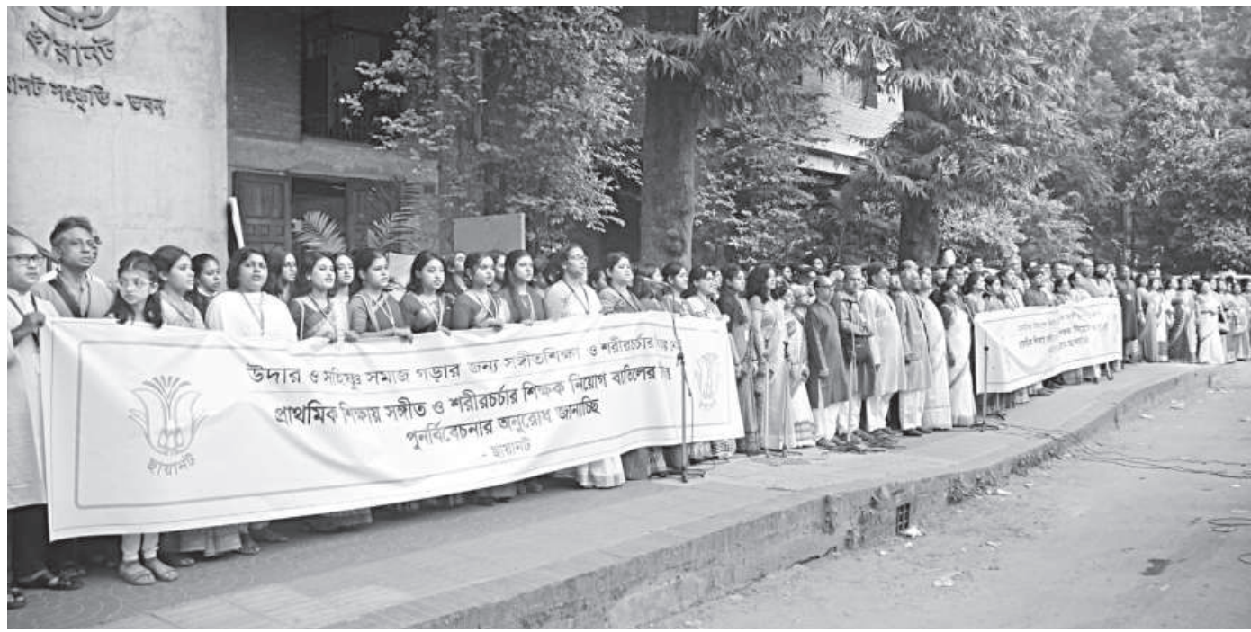
Protesting the government's decision to cancel the recruitment of music and physical education teachers in primary schools, members of Chhayanaut formed a human chain in front of its cultural centre in the capital yesterday.