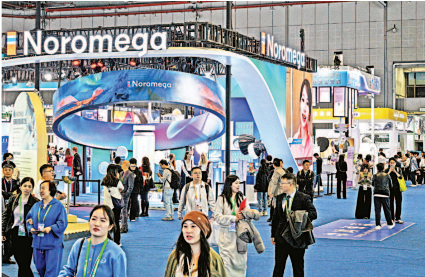
Visitors are seen next to the dietary supplements at the Noromega stall during the 8th China International Import Expo in Shanghai yesterday.