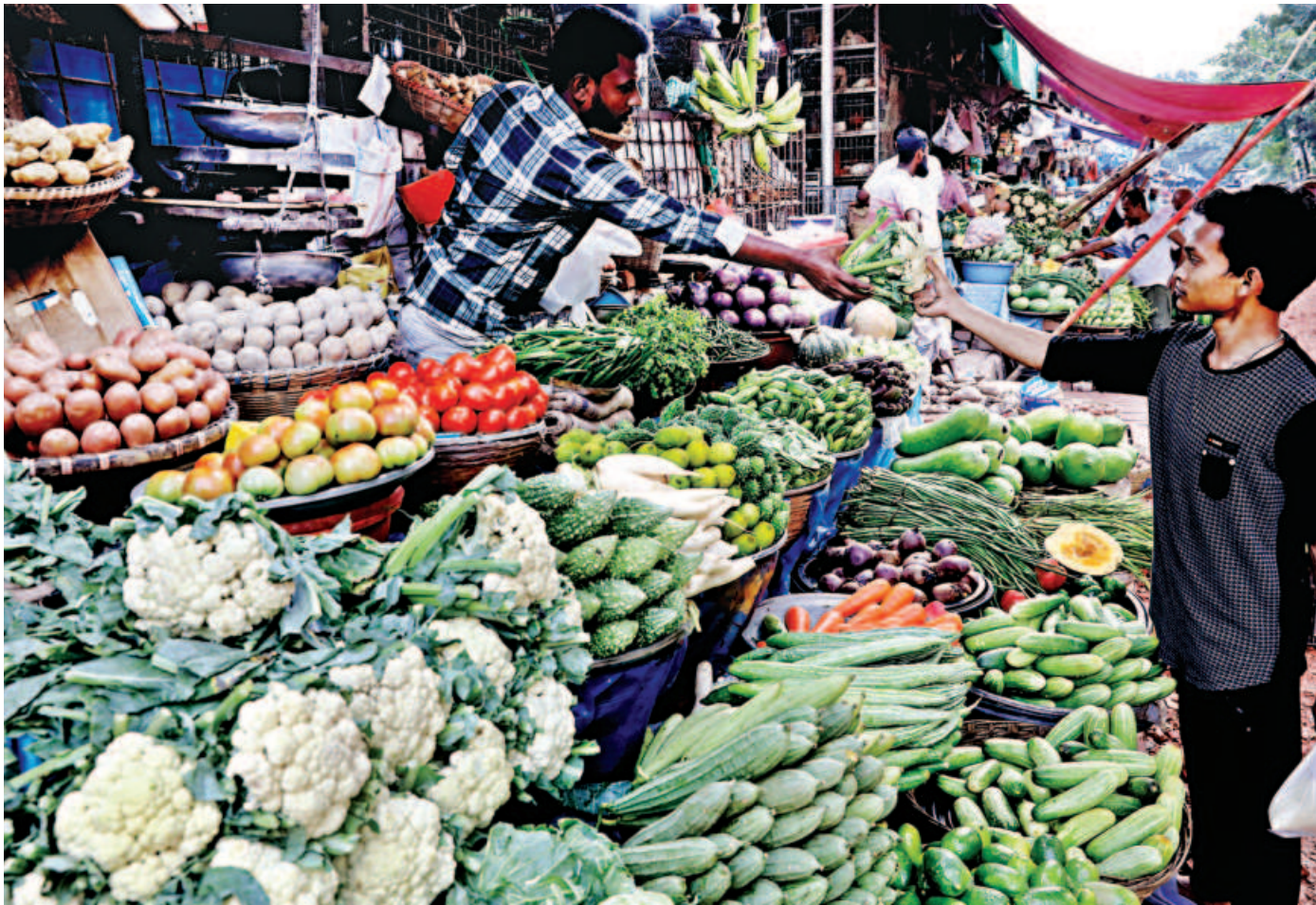
A man buys a cauliflower from a vegetable vendor in Hatirpool Bazar for Tk 65 yesterday. Even though there is adequate supply of winter vegetables, prices remain high in kitchen markets across the capital.