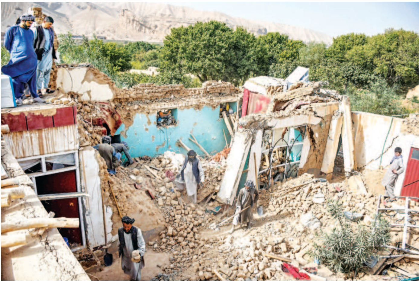
Afghan earthquake survivors search through the remains of a damaged house in a village in Tashqurghan, Khulm district of Samangan province, yesterday.