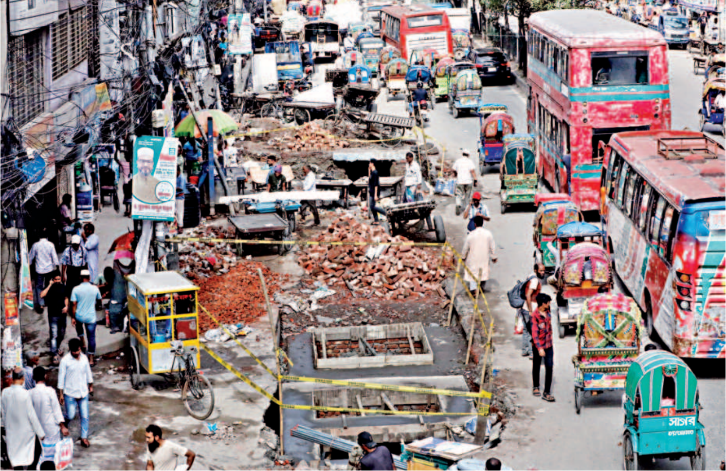
Drainage work by the Dhaka South City Corporation has left the Alu Bazar area of the Old Dhaka in a dilapidated state. As a result, pedestrians are forced to walk on the road, while vehicles have little space to pass through. Locals alleged that the work has been going on for nearly three months, causing immense suffering. The photo was taken yesterday.