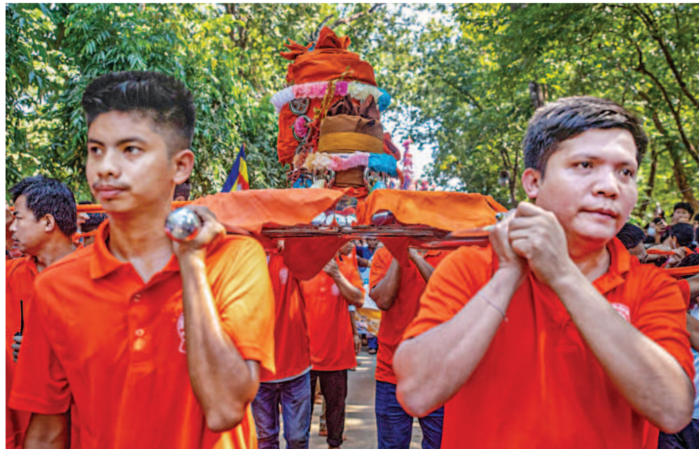
As part of this year’s Kathina Robe Offering Ceremony, Buddhist devotees carry robes they had woven overnight to be formally presented to the monks, marking the end of their three-month rains retreat, known as Vassa. The ceremony, which began on Thursday, included a series of religious rituals, with monks offering prayers for global peace and harmony. The photo was taken yesterday at Rajbana Vihara in Rangamati.

The polar rhino lived early in the Miocene epoch, a time of diversification of many mammalian groups. Until this discovery, no rhinoceros was known to have lived in such a high latitude. The fossil site is in Nunavut, Canada’s northernmost territory.