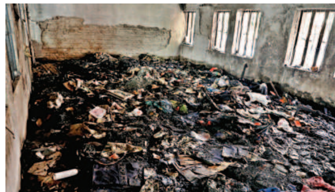
Khilgaon Police Station