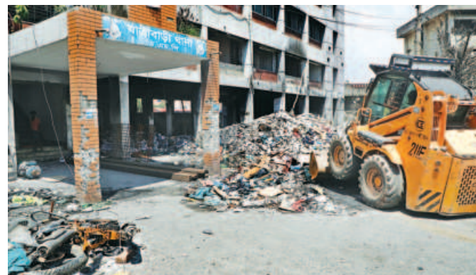
Jatrabari Police Station