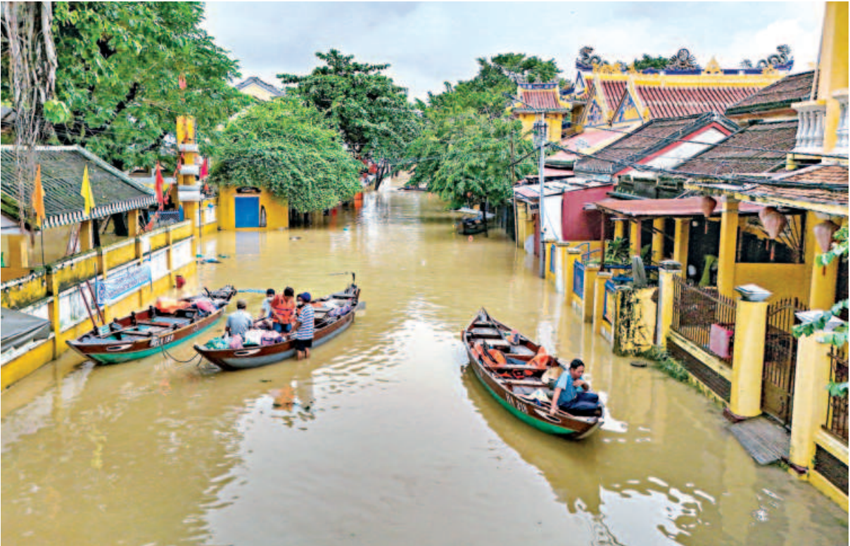
An aerial view shows people navigating a flooded street by boat after heavy rains in Hoi An, Vietnam, yesterday. Coastal provinces in Vietnam have been lashed by torrential rains since October 26, leaving at least 10 people dead.