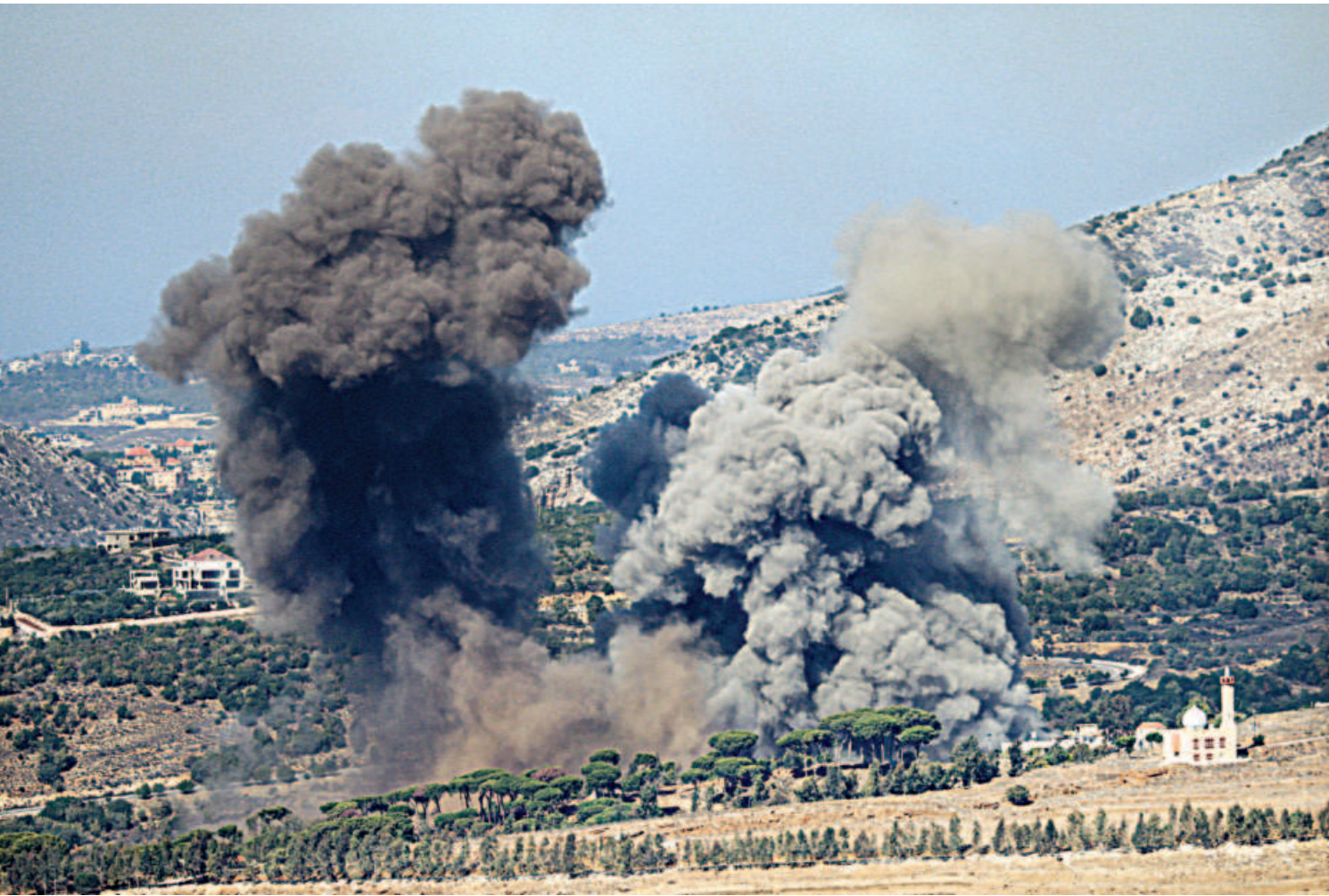
Smoke rises after an Israeli airstrike on the outskirts of the southern Lebanese village of Ej Jarmaq, yesterday. The Lebanese president ordered the armed forces to resist any Israeli incursions in the south following a raid that killed a municipal worker.

REUTERS, Islamabad Afghanistan and Pakistan have resumed peace talks in Istanbul, four sources familiar with the matter said yesterday, a day after Islamabad said the discussions had ended in failure. Three of the sources said the nations had recommenced talks at the request of mediators Turkey and Qatar, to ensure they do not resume border clashes that have killed dozens this month. One of the sources, a Pakistani security official, said Islamabad would press its central demand at the talks that Afghanistan take action against militants using its territory as a safe haven and to plan attacks on Pakistani soil. “Most of the issues between Pakistan and Afghanistan have been resolved successfully and peacefully. A few demands from Pakistan need some extra time as they are difficult to be agreed upon,” said a source close to the Taliban delegation. Islamabad accuses the Taliban of harbouring the Pakistani Taliban and allowing them to attack Pakistani troops from Afghan territory. Kabul denies this. Meanwhile, Pakistan said yesterday it had killed a deputy leader of the group in an operation near the Afghan border, a victory for Islamabad in the years-long insurgency it has been fighting. Qari Amjad, who Pakistan described as a “high-value target” and who was designated as a terrorist by the US, was killed in a clash after trying to cross into Pakistan from Afghanistan.