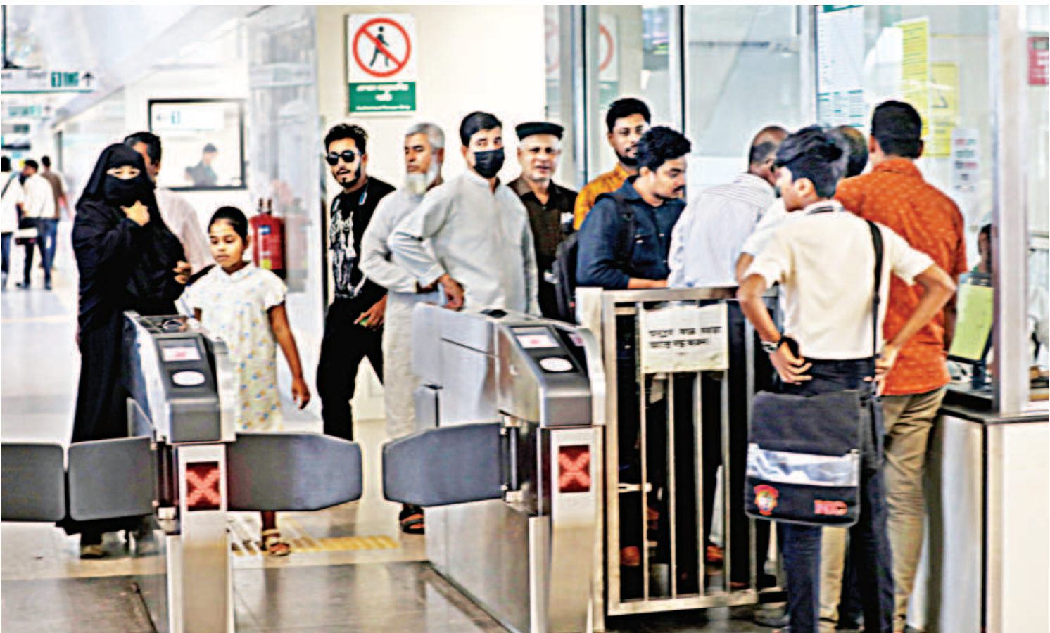
Commuters queue for tickets at the capital's Farmgate station after metro rail services fully resumed at 11:00am yesterday. Services had been suspended following the death of a pedestrian who was struck by a falling bearing pad from a metro rail pillar in the Farmgate area on Sunday.