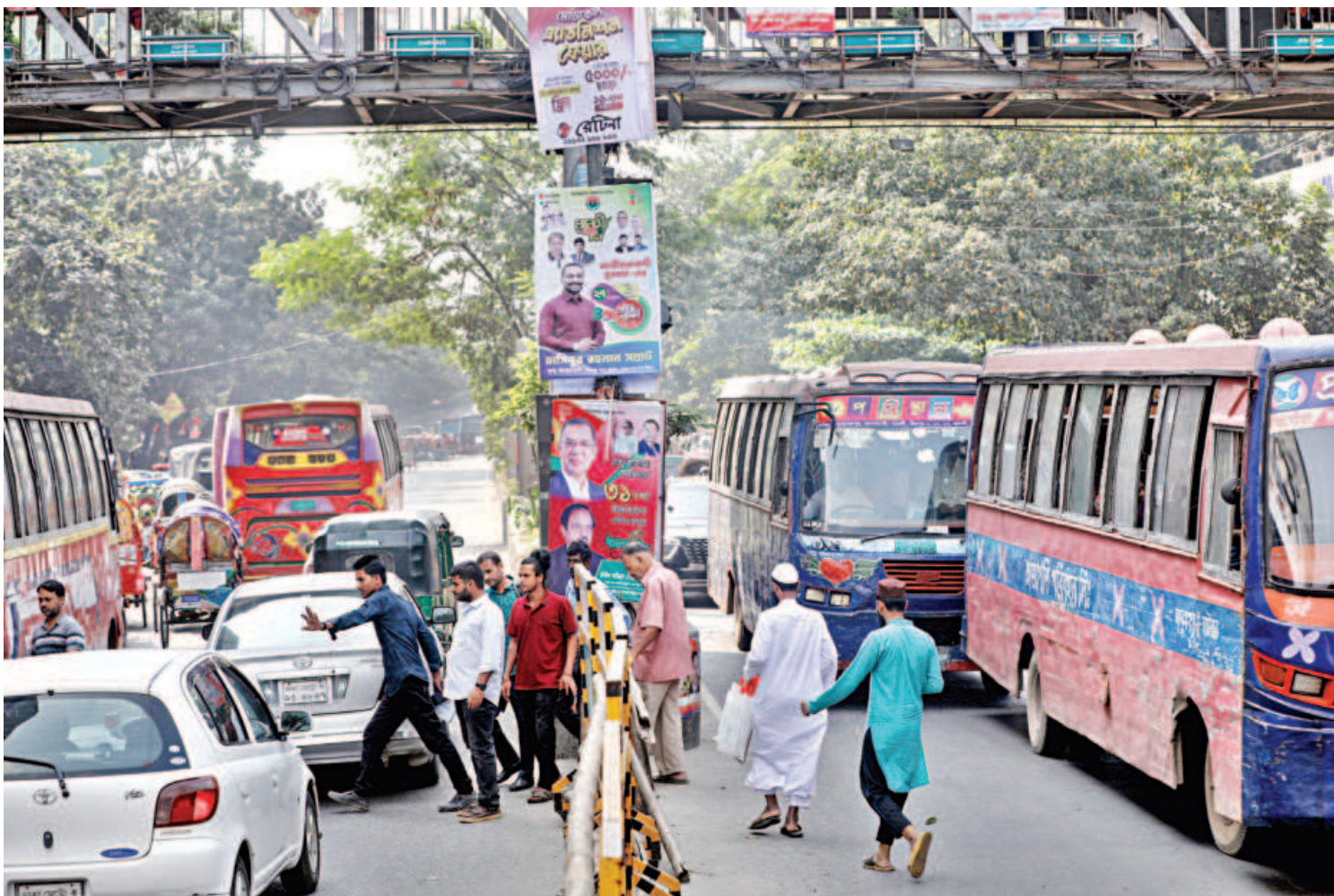
People risk their lives crossing the main road through gaps in a divider in the Mirpur 2 area of the capital, ignoring the footbridge located right above them. The photo was taken yesterday.