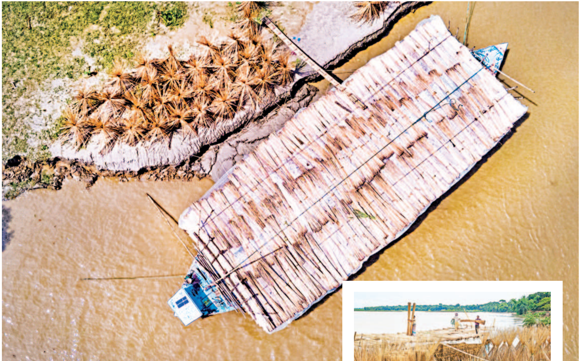
Jute sticks are being dried on a boat. The sticks can be used in multiple ways, including as fuel for cooking and creating fences and trellises. Every 100 sticks are sold for Tk 120 to Tk 140. The photo was taken at Chachoi village in Narail over a week ago.