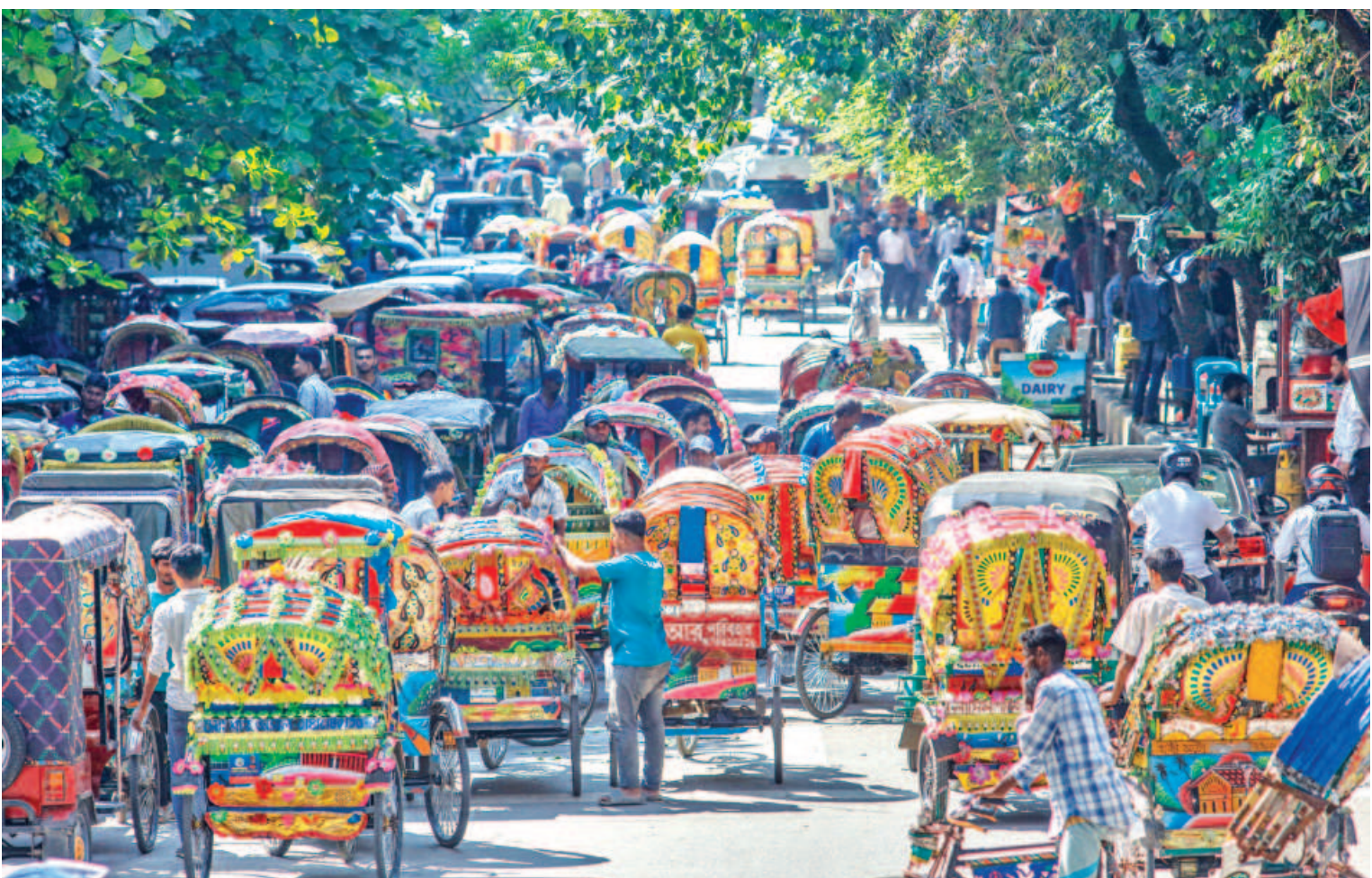
Battery-run auto-rickshaws crowd the main road in front of the IDB Bhaban, causing severe traffic congestion and immense suffering for commuters. Although such rickshaws are not permitted on the main roads, they continue to defy the rules, creating major problems for regular vehicles that use the route daily. The photo was taken recently.