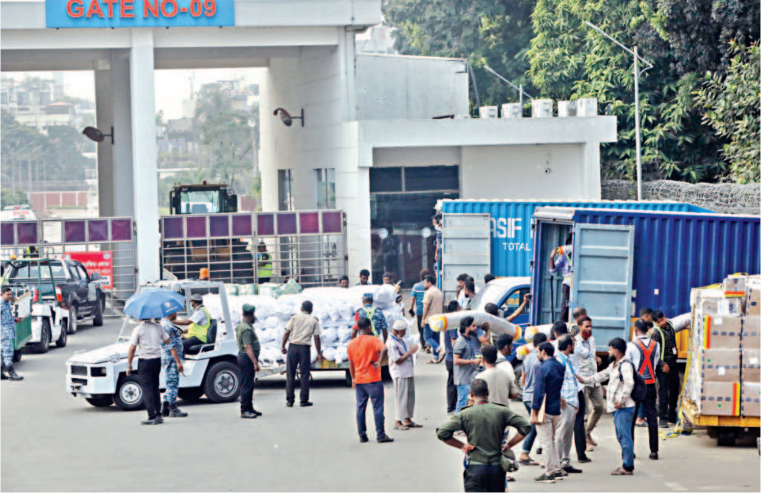
Clearing and forwarding agents, along with importers, collect their goods from Gate-9 of Hazrat Shahjalal International Airport. Following the recent fire at the airport's cargo village, large volumes of imported goods are being stored in Biman's hangar near Gate-9. C&F agents are now collecting their deliveries as quickly as possible, especially temperature-sensitive items such as vaccines. The photo was taken yesterday.