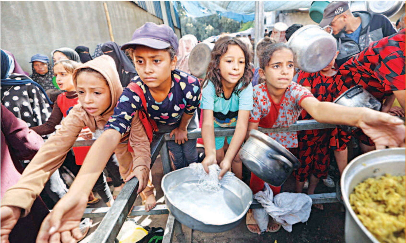
Palestinian children gather for food distributed by a charity kitchen in Nuseirat refugee camp, central Gaza Strip, yesterday—one week after a ceasefire took effect. Story on page 5.