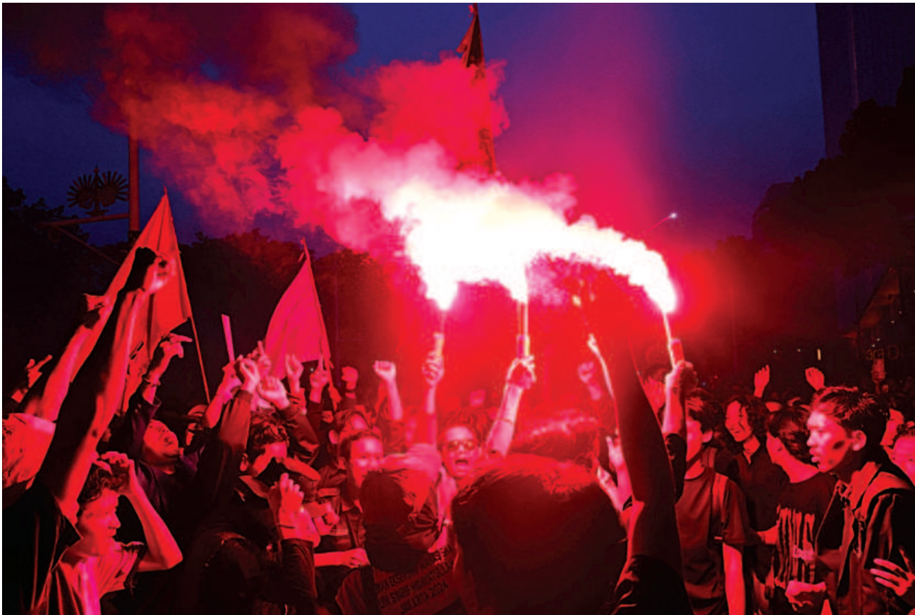
University students light flares during a protest marking the first anniversary of Indonesian President Prabowo Subianto’s administration, criticising government policies—particularly the free meals program—in Jakarta, Indonesia, yesterday.

In comments to media at a meeting on Sunday and cleared for use yesterday, Zelensky said the systems would be supplied every year for a number of years, and that Ukraine would seek for some European nations to give Kyiv priority in the queue for the systems.