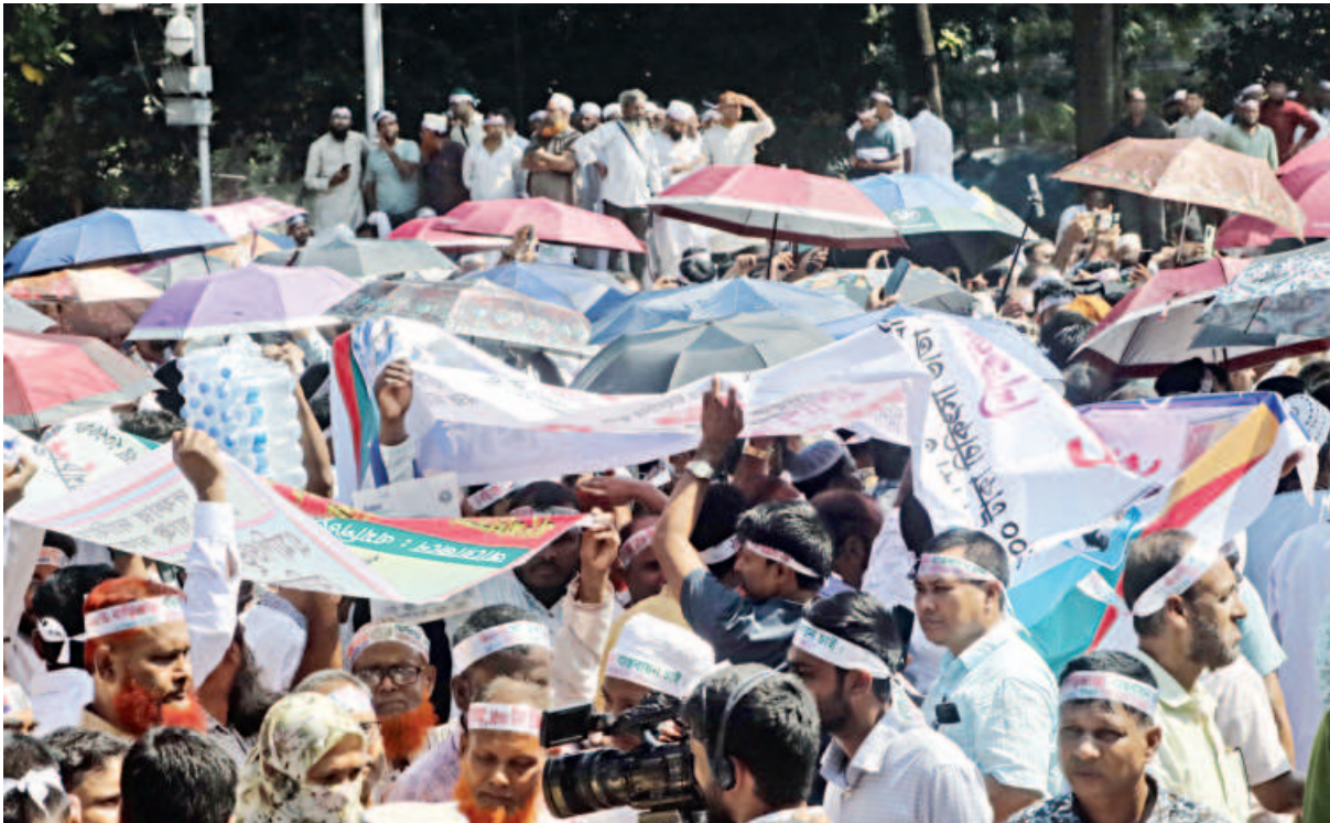
Under the scorching October sun, protesting MPO teachers huddle beneath umbrellas and banners for shade at the Central Shaheed Minar yesterday, as their demonstration over a three-point demand entered its ninth consecutive day.

yesterday urged law enforcement agencies not to harass people from religious minority communities. “I want to say something very clearly to you [law enforcement agencies]. I receive a lot of news. No one should harass anyone from minority communities. We stand beside them and will remain beside them with all our strength,” Fakhrul said at a programme held at the party chairperson’s office in Gulshan. Leaders from the Matua community, Shri Guru Sangha, Sanatan Sewa Ashram, and Hindu Sangha Samiti attended the event. Reassuring the Hindu community, Fakhrul said, “From now on, you will find us beside you. We are with you, and we will remain with you.”