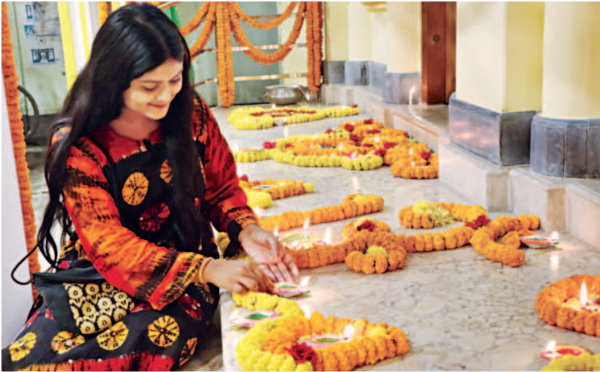
A young woman lights clay lamps, surrounded by marigold decorations, on the floor of a temple in the Hospital Road area of Barishal city yesterday evening. On the occasion of Kali Puja and Diwali, Hindu devotees decorated their homes and temples with lamps, candles, and colourful flowers to celebrate the festival of lights.