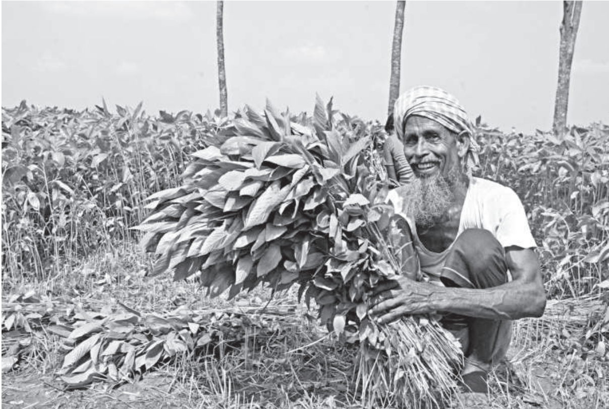
A farmer collects jute spinach (pat shak) from a field in Tetla, Paba upazila, Rajshahi. Having harvested jute from the same field a few days ago, farmers are now using the jute plants as a leafy vegetable, which they can sell in the market at a good price. The photo was taken recently.