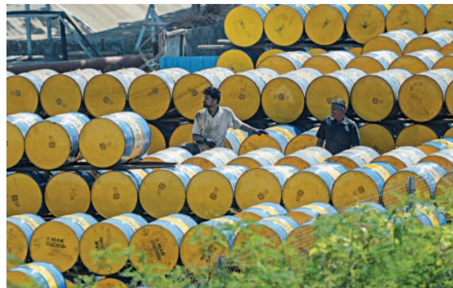
Workers stack oil barrels at a filling station in Chennai. India relies on foreign suppliers for more than 85 percent of its oil needs.

New Delhi imported a little over 1.6 million barrels per day from Russia in September, according to trade intelligence