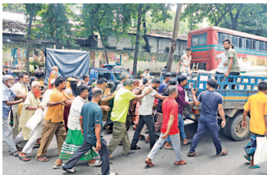
People rush to a truck near the Secretariat in Dhaka to buy subsidised food items meant for low-income groups. Poverty in Bangladesh had been declining for decades but is now showing signs of rising again amid high inflation, slow job growth and limited social protection.

"Although I didn't need to undergo surgery, I had to visit Khwaja Yunus Ali Medical College, a private hospital about