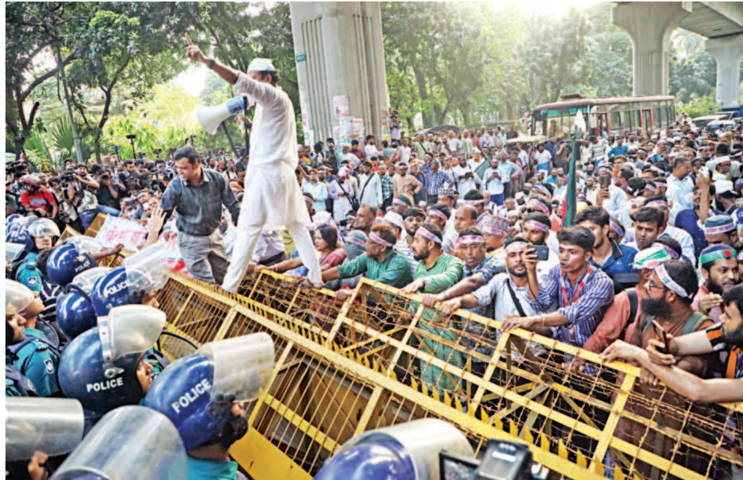
Police intercept teachers from non-government MPO-listed institutions near the High Court gate during their "Road to Secretariat" march yesterday. The teachers continued their indefinite work abstention for the third consecutive day, demanding a 20 percent house rent allowance and other benefits.