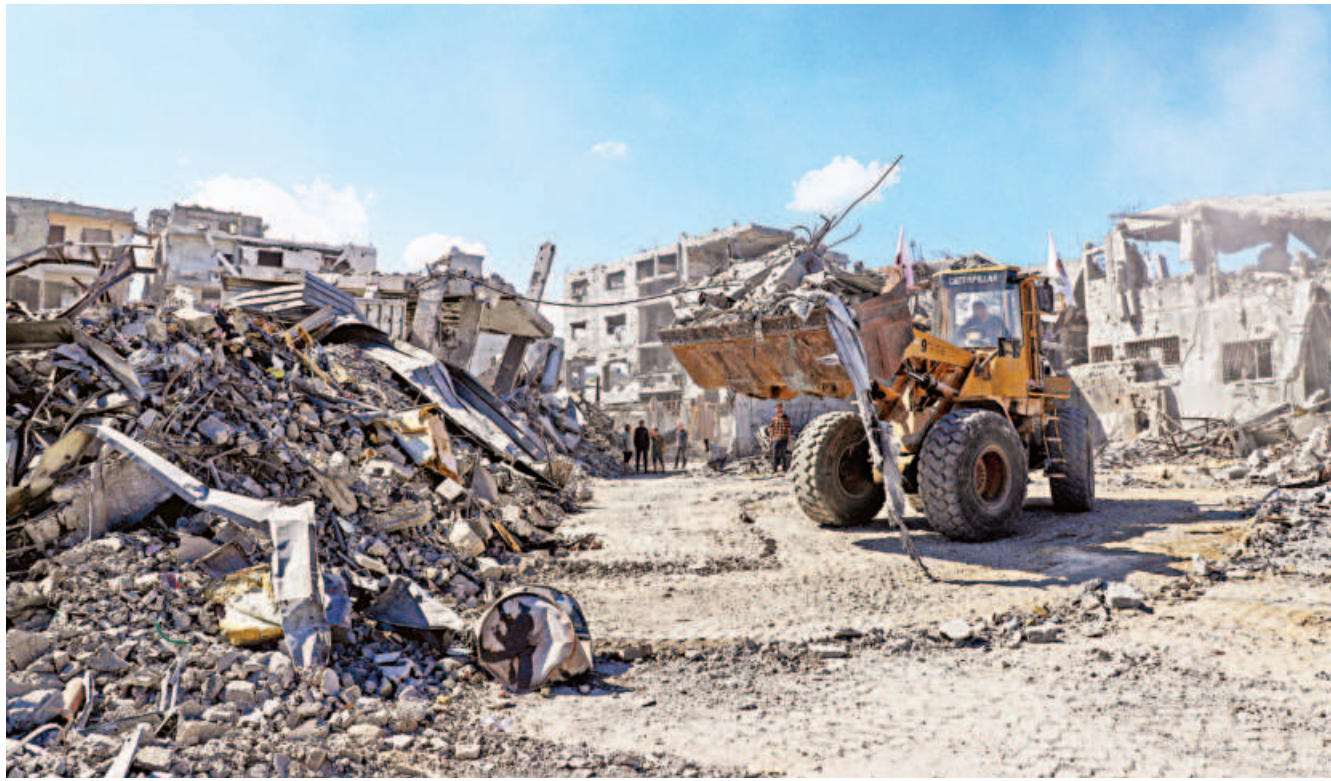
A digger removes debris from a street, amid a ceasefire between Israel and Hamas, in Gaza City, yesterday.