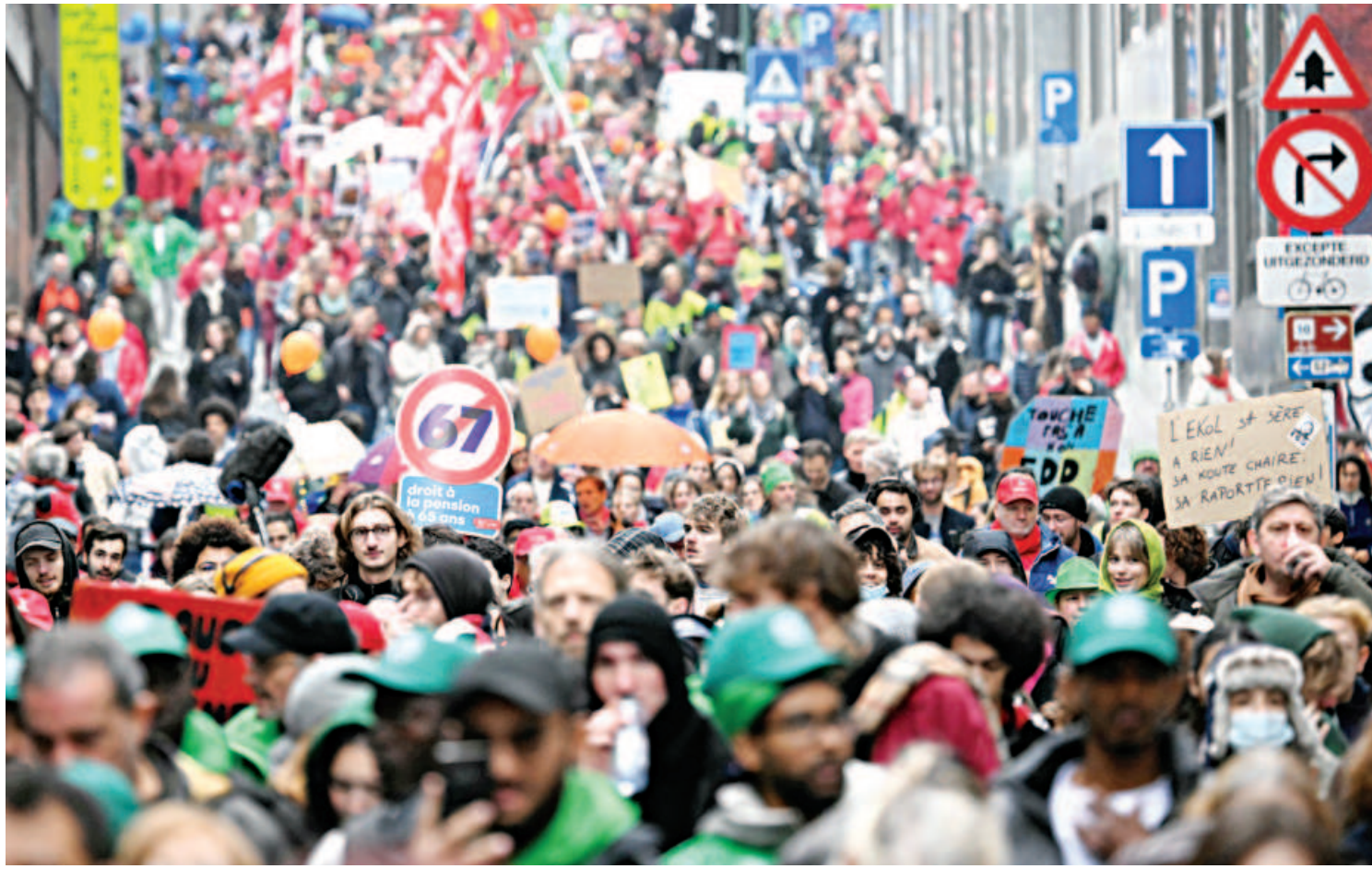
Protesters hold a slogan reading "Right to have pension at the age of 65" as they take part in a demonstration during a national day of action against the austerity of the federal Arizona government, in Brussels on October 14, 2025. The strike is the last in a series to hit the European country since Flemish nationalist Bart De Wever took office as prime minister in February. Grappling with a budget deficit whose size violates European Union rules, the government is looking to reform pensions and make other savings that have infuriated trade unions.

"Such restrictions have already forced some EU companies to halt production, causing real economic harm. This is not about security or non-proliferation. These controls are targeting civilian industries directly," Sefcovic said.