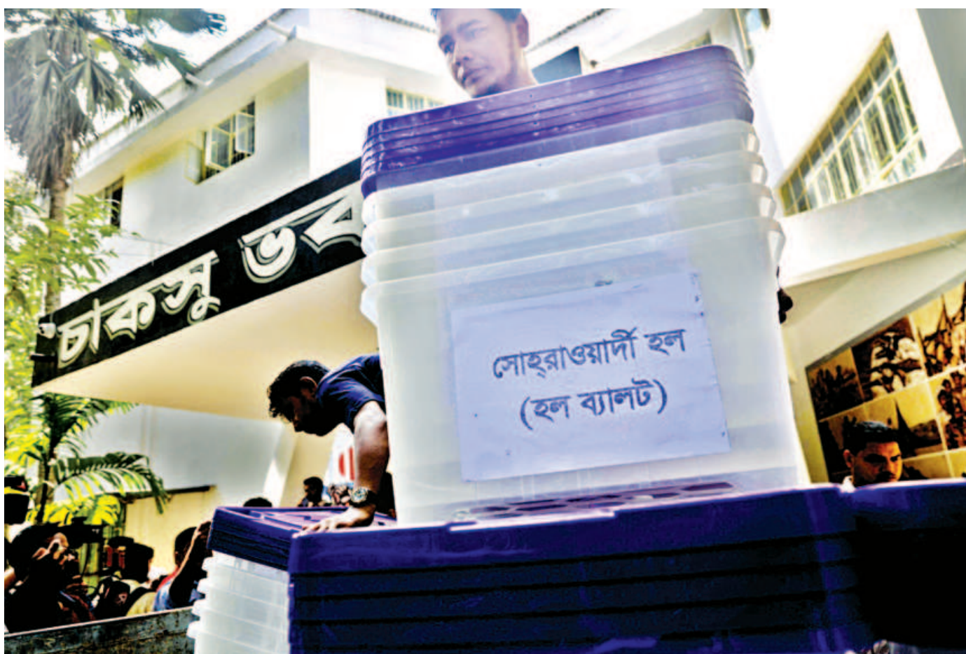
Election materials are being transported to polling stations as the Chittagong University Central Students' Union (Cucusu) and hall unions go to polls today. The photo was taken in front of the Cucusu building yesterday.

"Distressed by the loss of lives due to a mishap in Jaisalmer, Rajasthan. My thoughts are with the affected people and their families during this difficult time," Indian Prime Minister Narendra Modi said in an X post.