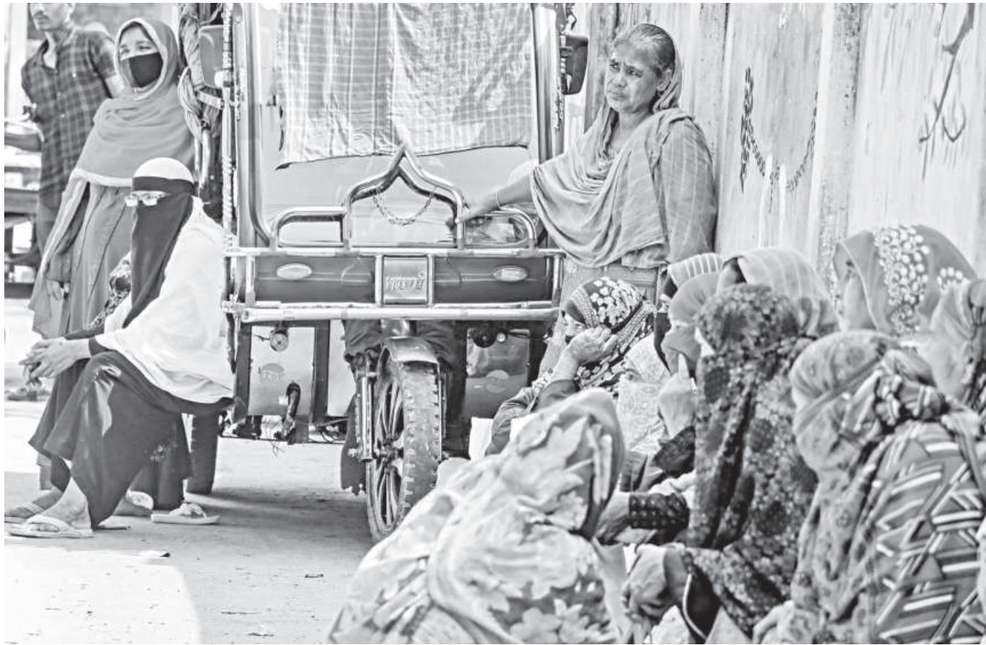
Individuals from low-income households wait in line early in the morning to buy rice at Tk 30 per kilogramme from OMS (open market sale) dealers on Boyra College Boundary Road in Khulna. Like them, many endure long hours to purchase daily essentials at a subsidised rate.

Police submitted a charge sheet on March 31, 2018.