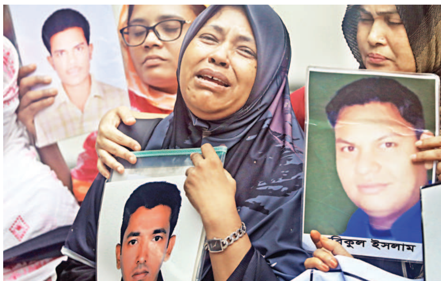
Holding a picture of her loved one who has been forcibly disappeared, a woman breaks down in tears at a human chain in front of the High Court yesterday. Mayer Daak, a platform of the families of the victims of enforced disappearances, organised the event demanding the return of their missing relatives and punishment for those responsible.