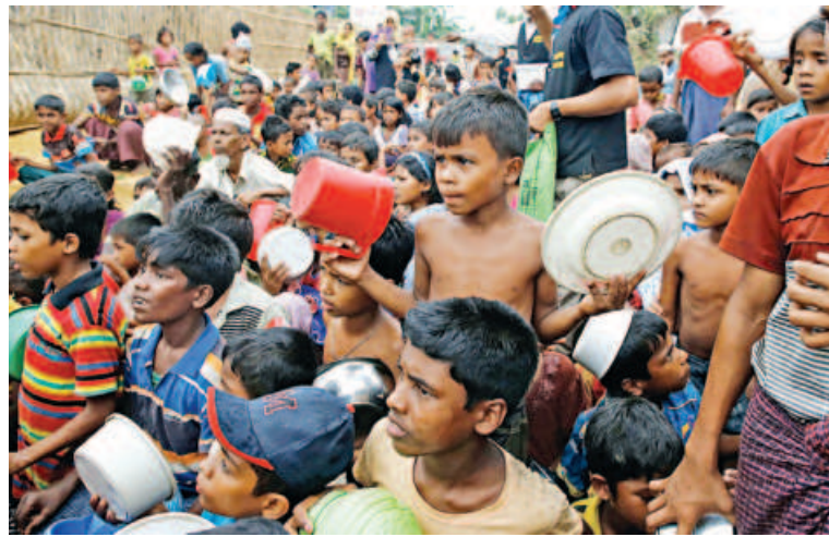
Rohingya refugee children wait to receive food outside the distribution center at Palong Khali refugee camp in Cox's Bazar, Bangladesh, on November 17, 2021.

But the surge comes at a time when the United States --