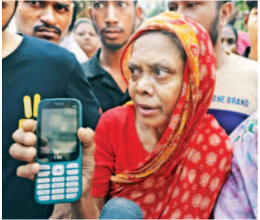
A woman shows the photo of her missing relative.

"This loss of innocent lives in such a tragic