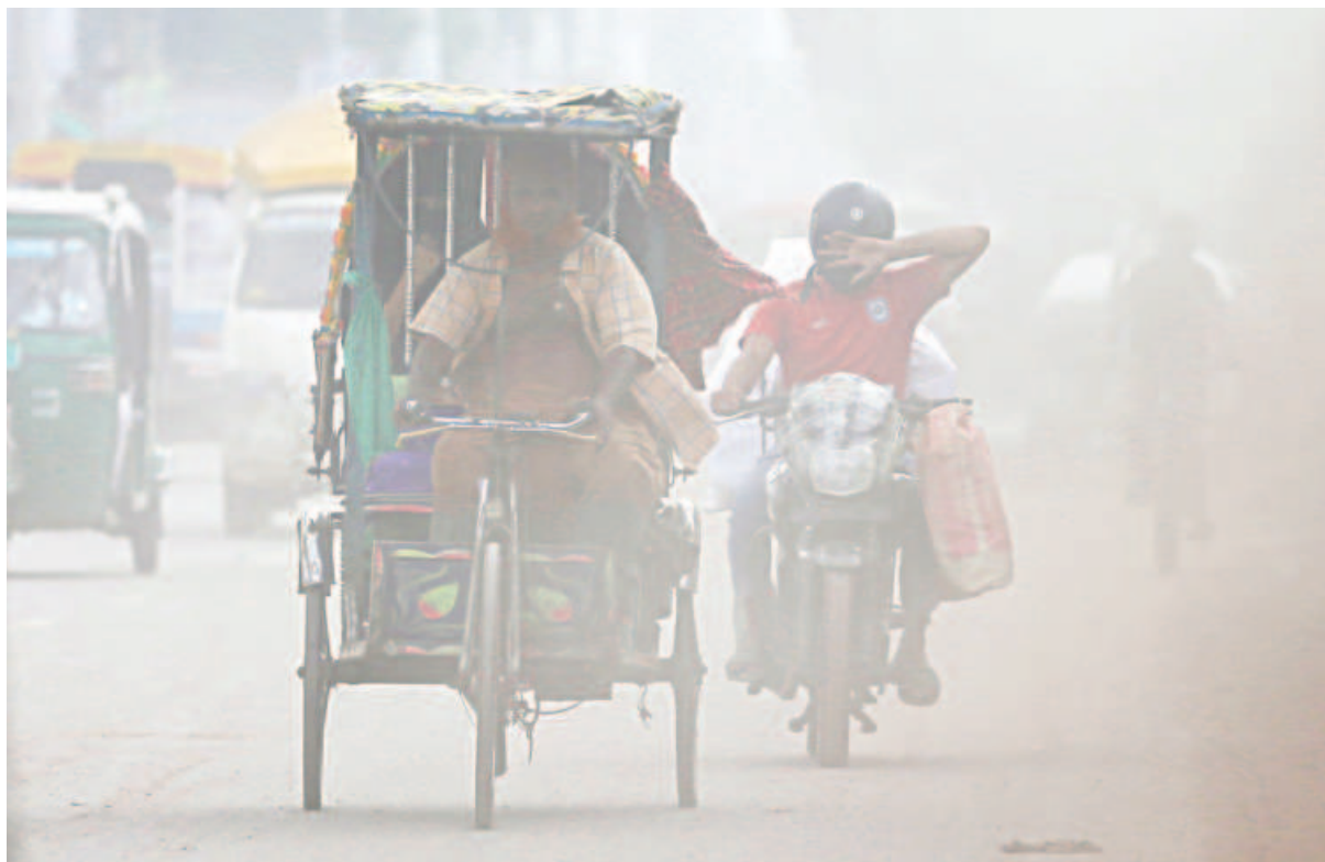
A motorcyclist covers his nose on a road in Uttar Jurain. During the dry season, vehicle movement stirs up fine dust particles, which can cause respiratory issues, eye irritation, and skin problems. Locals say the situation has worsened due to irregular water spraying and unfinished roadwork.