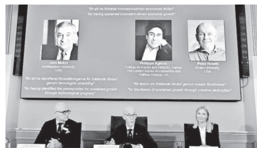
Joel Mokyr, Philippe Aghion, and Peter Howitt won the Nobel Prize in economics this year for explaining how innovation creates sustained prosperity.

formalises an economy where firms climb a quality ladder by innovating, and every innovation replaces the old one, taking business away from existing firms. Growth, therefore, arises within the economy itself, driven by the motivation to stay ahead and earn profits from new ideas. But this process involves a delicate balance. If policymakers protect established firms too much, they discourage new ideas and competition. On the other hand, if inventors are not protected enough, they lose the incentive to invest in innovation.