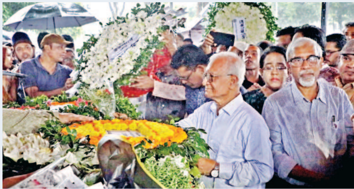
Professor Emeritus Serajul Islam Choudhury lays a wreath at the coffin of Professor Emeritus Syed Manzoorul Islam at the Central Shaheed Minar yesterday. Manzoorul was buried at the Martyred Intellectuals' Graveyard in Mirpur after two civic tributes -- one at Dhaka University's Aparajeyo Bangla and another at the Central Shaheed Minar.