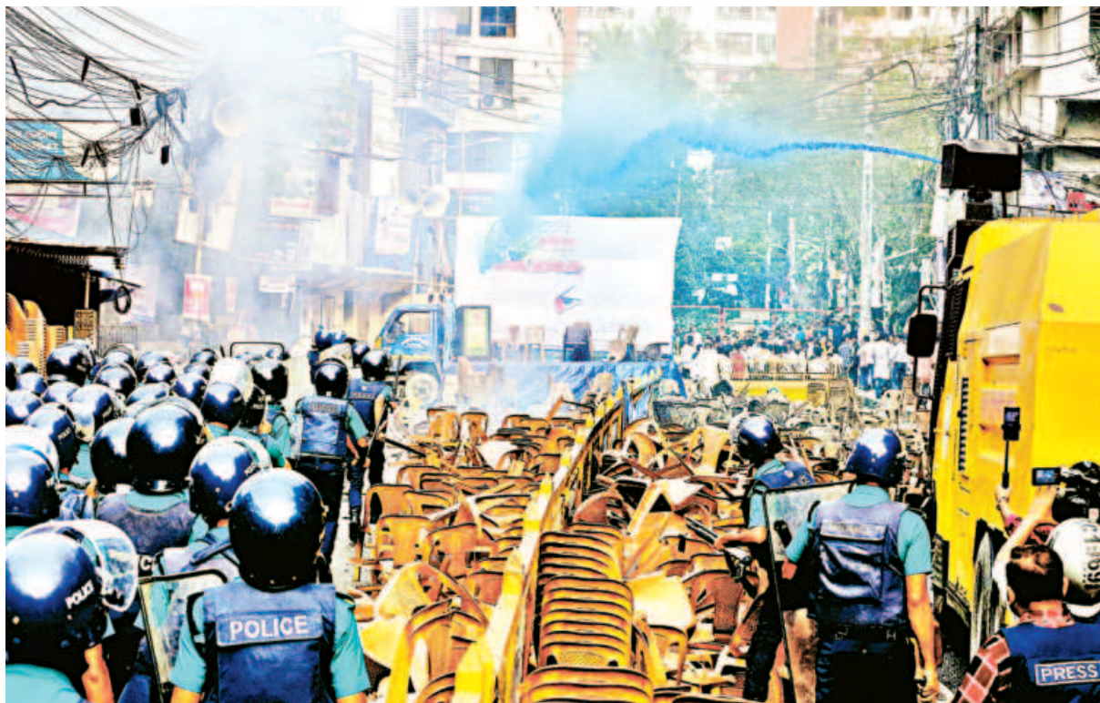
Police use a water cannon as officers approach the stage after dispersing the participants of a Jatiya Party rally, organised by blocking the street in front of the party's central office in the capital's Kakrail yesterday afternoon. Story on page 3.