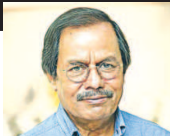
Syed Manzoorul Islam (1951-2025)