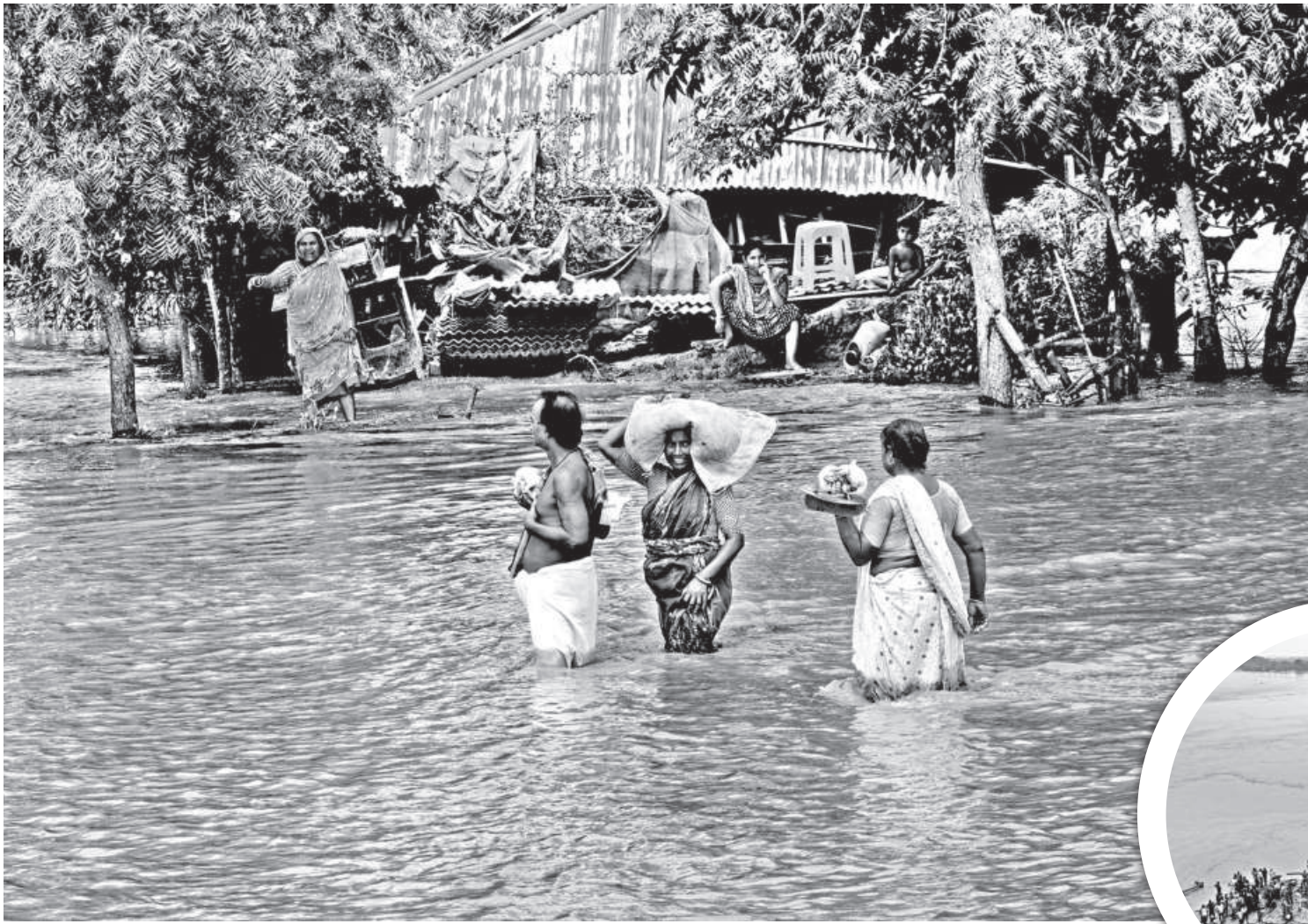
People wade through knee-deep water in Botbunia of Khulna's Dacope upazila yesterday, as vast areas remain inundated following the collapse of an embankment on the Dhaki river. Inset, the breached section of the embankment near Harisabha Temple in Tiladanga union.

Among the total cases, 50,209 dengue patients have been released so far after treatment. Currently, 2,452 dengue patients are undergoing treatment at different hospitals across the country, 1,625 of whom are from outside Dhaka.