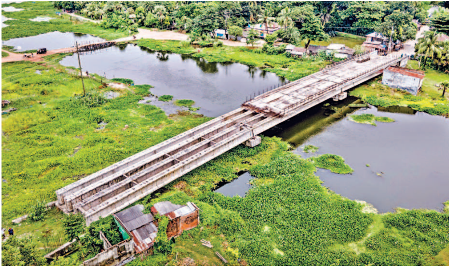
Construction of the Tekarghat bridge in Jessore's Abhaynagar has been halted for a long time, affecting the people of Abhaynagar and Manirampur upazilas. The work over the Teka river began in 2021 and was scheduled to finish by 2023. Locals now have to cross the river using a wooden bridge, top left.