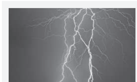
In Cumilla several people were waiting for the Uzanchar-Ghagutia ferry when heavy rain began. Moments later, lightning struck the area, killing two women and one man on the spot.