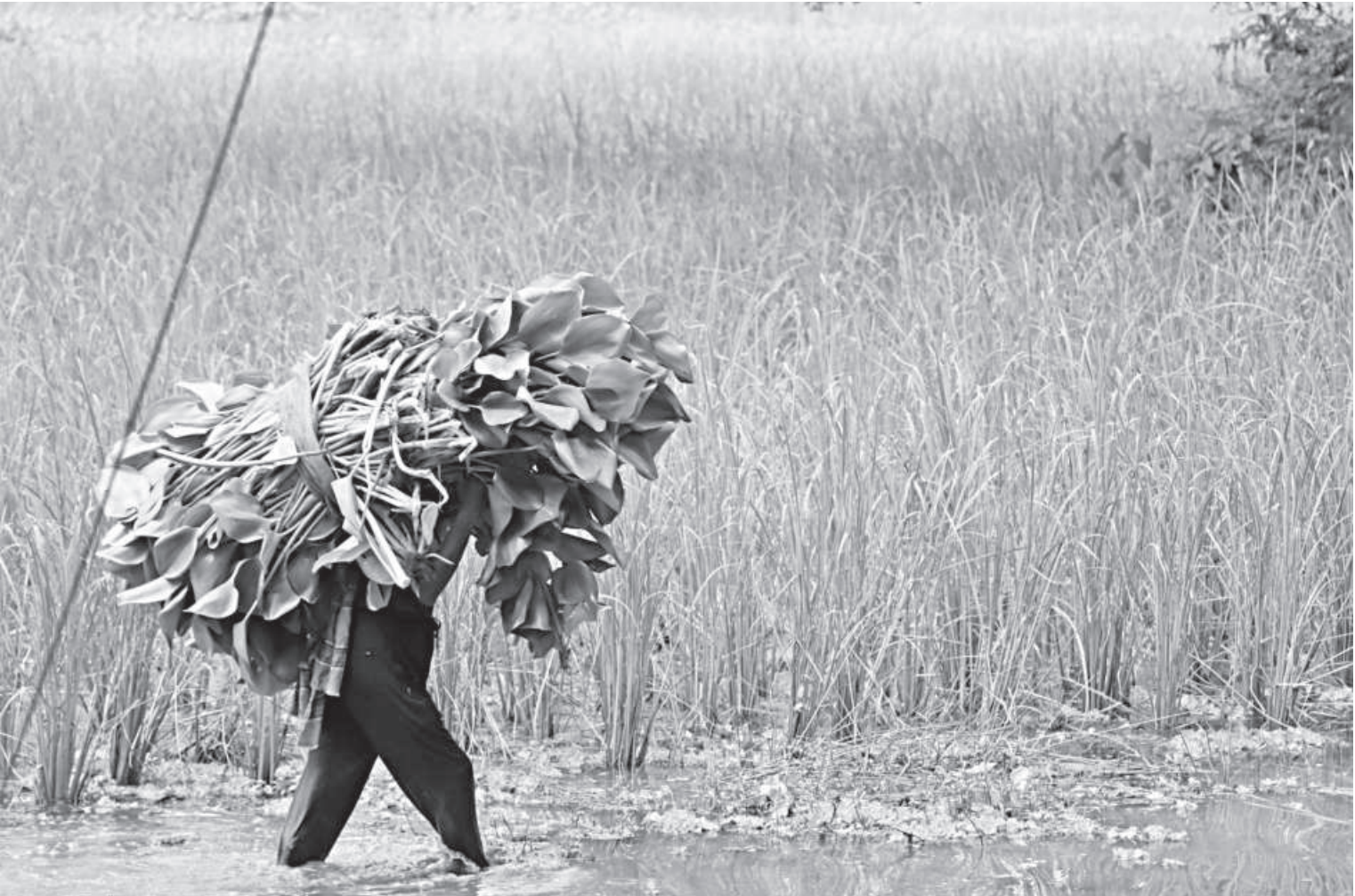
A farmer cuts and collects water hyacinths from his field. Heavy rainfall in the month of Ashwin has left large portions of farmland waterlogged. To protect Aman paddy seedlings, the farmer has to remove the water hyacinths from the plant beds. The photo was taken in Uzirpur upazila of Barishal yesterday.

The deep depression over coastal Odisha and adjoining area moved northwestwards, weakened into a land depression over Odisha and adjoining Chhattisgarh at 3:00pm yesterday, according to Bangladesh Meteorological Department. It is likely to move in a north-northwestward direction further and weaken gradually. Under its influence, steep pressure gradient persists over the North Bay. Gusty or squally weather may affect the maritime ports, the North Bay and adjoining coastal areas of Bangladesh, according to the BMD update. Maritime ports of Chattogram, Cox's Bazar, Mongla and Payra have been advised to keep hoisted local cautionary signal 3. All fishing boats and trawlers over North Bay have been advised to remain close to the coast and proceed with caution till further notice, reads the update.