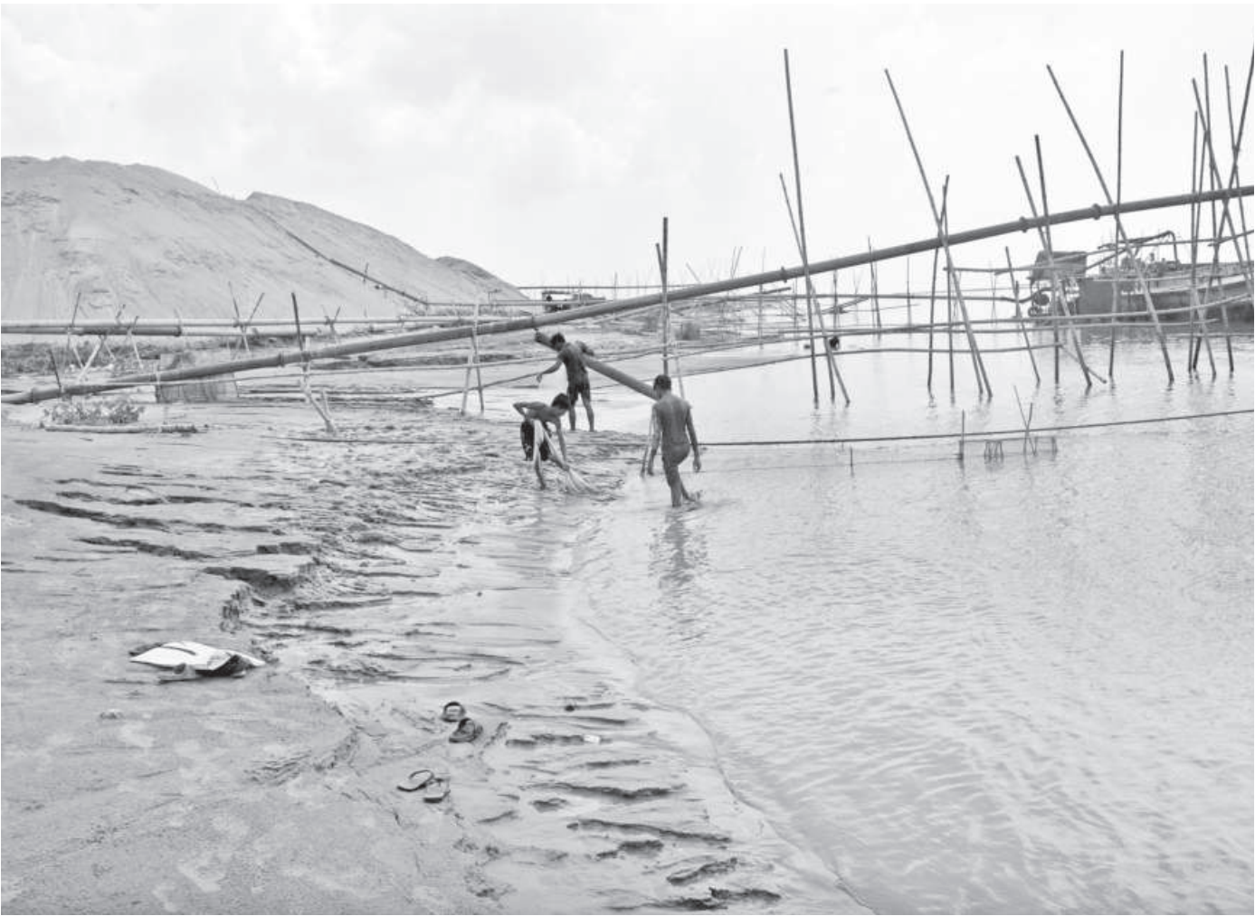
Sand extraction continues in the Padma river in Rajshahi, with dredging taking place day and night, even from protective embankments meant to safeguard this erosion-prone area. Such indiscriminate extraction is damaging the river and embankments, leading to severe erosion that threatens nearby homes. The photo was taken from the Bidhirpur area in Godagari upazila yesterday.