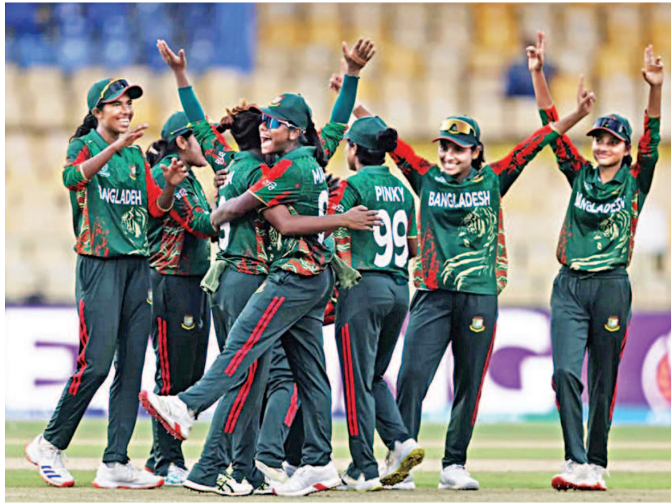
Bangladesh players celebrate the fall of another Pakistan wicket during their ICC Women's World Cup opener at the R Premadasa Stadium in Colombo yesterday.

Agrani Bank slipped back into heavy losses after a fleeting rebound in early 2025. By contrast, Sonali Bank, the largest state-owned lender, has staged a modest recovery, posting a net profit of Tk 591 crore in