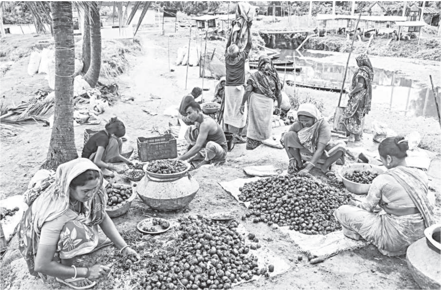
In Manirampur upazila of Jashore, local women spend their days breaking snails brought in by traders. The flesh goes to fish enclosures, the shells to poultry feed, and the women earn Tk 130 for every sack of snails -- a small but vital boost to their seasonal income. The photo was taken yesterday.

Divers from the fire service in Rangamati town have been informed, while locals were conducting searches till filing of the report around 8:00pm.