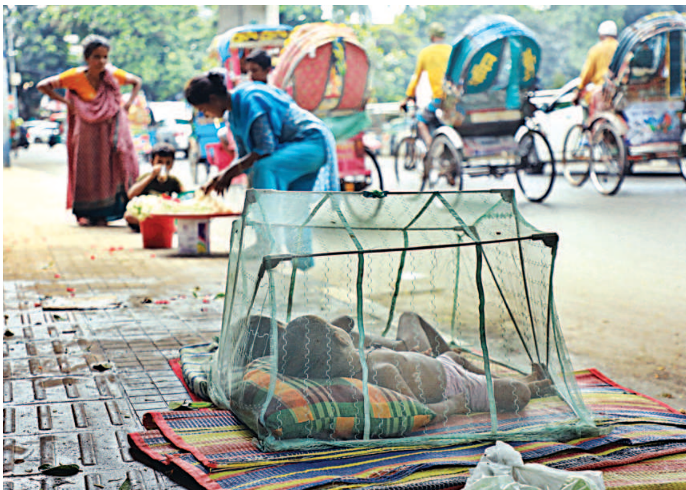
On a pavement near Dhaka University's Milon Chattar, two children sleep under a mosquito net -- shielded from the threat of dengue. Having no other choice but to bring them along, their mother, a flower seller, tends to her stall in the background. Her struggle for survival means taking care of livelihood and her children at the same time. The photo was taken yesterday.