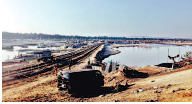
SOMESHWARI RIVER, NETROKONA