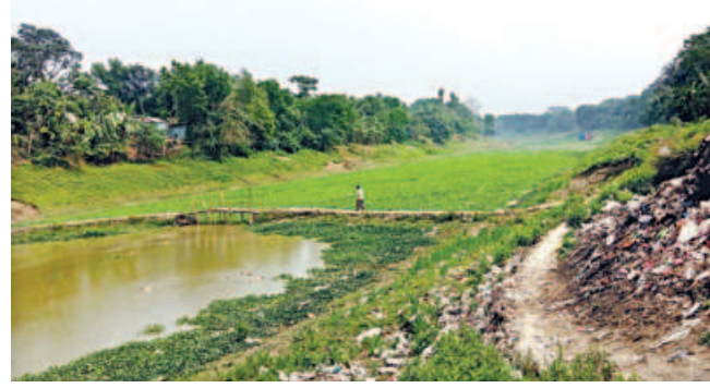
BARAL RIVER, NATORE